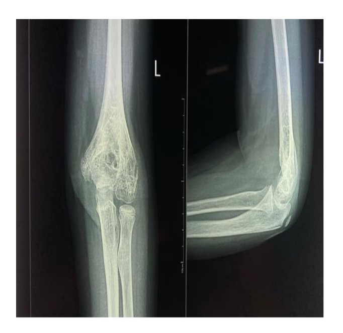
Figure 4: One year post op X-ray.