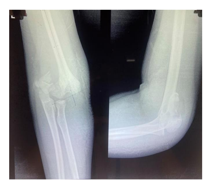
Figure 1: Pre-operative X ray.

The patient additionally developed ulnar nerve palsy following the procedure and had weakness of the flexor carpi ulnas and reduced sensation over the autonomous zone of the ulnar nerve.