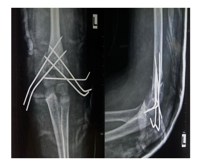
Figure 2: Post operative X ray.