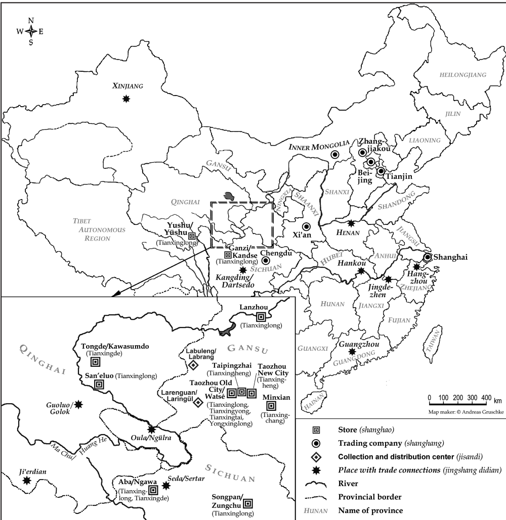
Figure 3: Xidaotang trade network in the 1930s.

(Plan made and provided by Xidaotang management committee in Lanzhou)