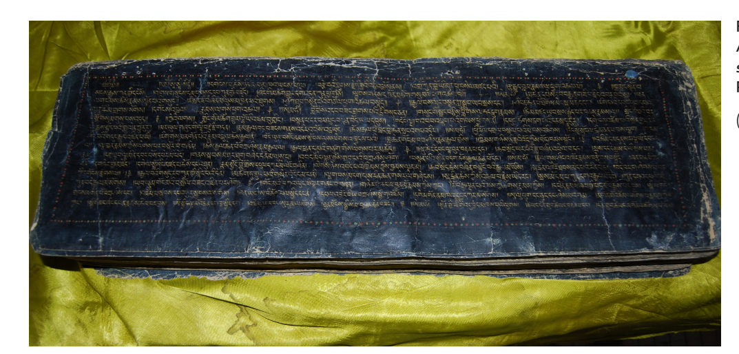
Figure 2. Colophon to the golden Aṣṭasāhasrikā-Prajñāpāramitāsūtra, Basgo Private Collection.