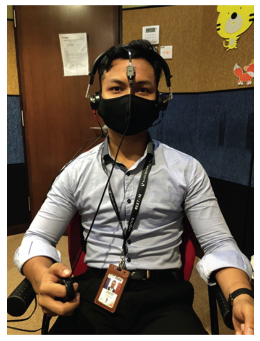
Figure 1: The sensorineural acuity level (SAL) test procedure of a representative subject.