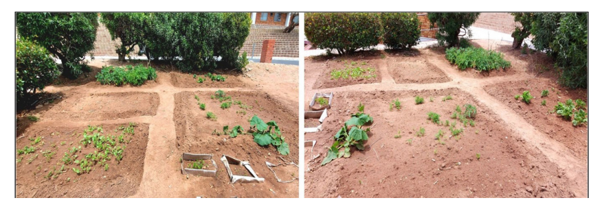
Figure 4: Vegetable garden created by a staff member of the SAMA officers' mess

Figure 4 shows pictures of the vegetable garden started by one of the staff members of the SAMA officers' mess. The vegetable garden was planted by using leftover food from the kitchen, and is located behind the mess building and is maintained by the mess personnel.