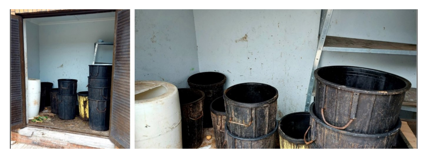
Figure 3: The pigswill containers used at the SAMA officers' mess

Food off-cuts are small pieces of waste food that are cut off from larger pieces, such as fatty tissue and bones. The pigswill is given to local farmers who come to the SAMA and collect the pigswill once it is full: "There are two farmers that come and fetch the pigswill, I don't know who they are" (P1). See Figure 3 below for the pigswill containers being used at the SAMA officers' mess.