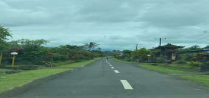
Figure 2. Natural atmosphere and residents' houses in Pinge Traditional Village, Marga, Tabanan Bali

The economic structure of the Pinge Tourism Village, Tabanan, Bali is still an agrarian pattern which focuses on the agricultural sector, this is supported by the use of agricultural land which still has a portion that is spread as much as 85% of the total village land use, also around 80% of the livelihoods of the population depend on this sector. agriculture. In the agricultural sector, the commodity that stands out as the prima donna or mainstay is coffee. Several economic sectors that are classified as Economic Base besides the agricultural sector are: (1) Agro Tourism, (2) Nature Tourism, (3) Cultural/Religious Tourism, (4) Culinary Tourism and, (5) Agro-Hulticultural Market [6]. It is hoped that this will have a positive impact on the economic development of the Pinge Traditional Village as a whole. Below is picture 2. The natural atmosphere and the houses of the people in the Pinge Traditional Village are clean and very beautiful.