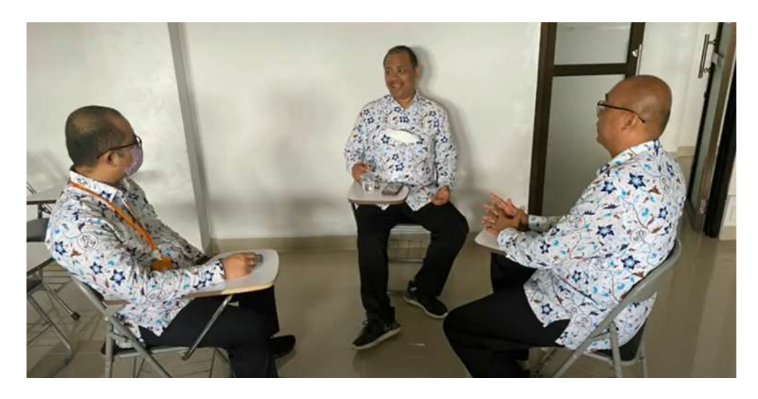
Figure 3 Initial Coordination of Activity Preparation

team held a team meeting to discuss preparation for community service activities after the announcement of acceptance of the 2022 Community Service grant proposal. for maximum benefit to partners.