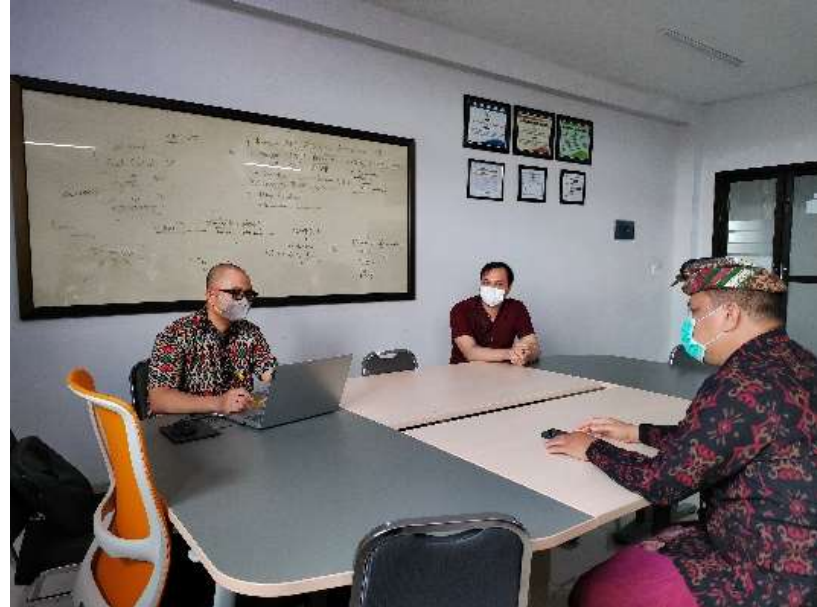
Figure 5. Coordination of Equipment Purchases for Service Partners PKM implementation

After knowing the needs of service partners, namely the Pinge Tourism Village PKM assisted group, the team held a meeting to map the socialization material by purchasing the equipment needed during the service.