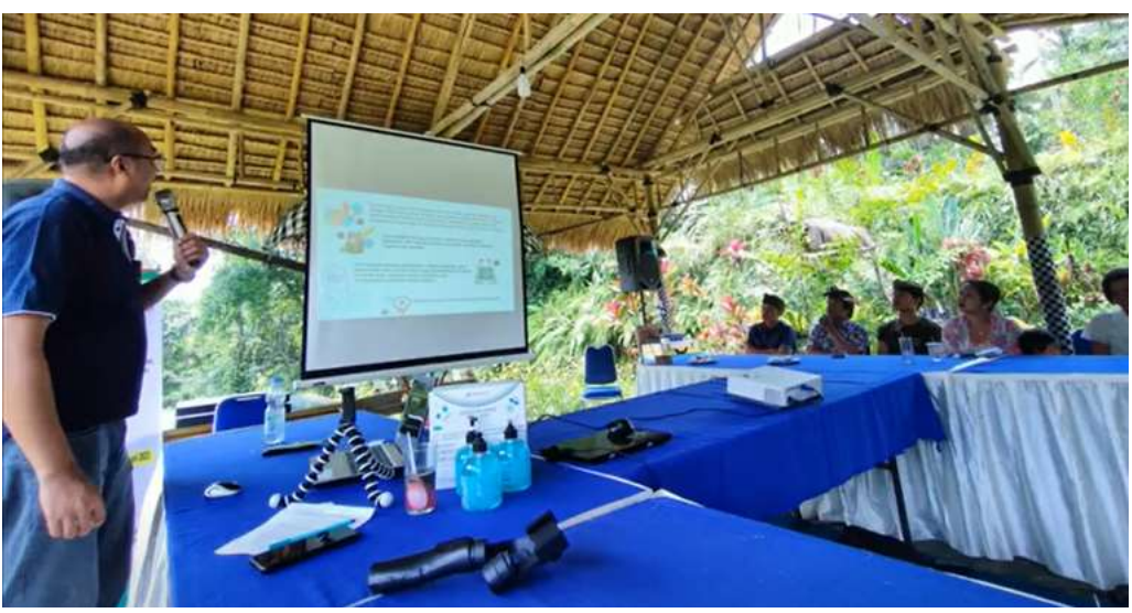
Figure 8. Implementation of Community Service regarding CHSE