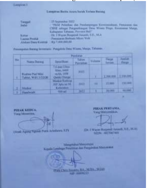
Figure 11. Minutes of Handing Over of Equipment/Goods Aid

In the closing activities of community service activities, at the same time handover of tool assistance from the service team to Partners is carried out. The tools provided are as follows: Masks, Handwash, and Realme Tablets to create digital content on social media. The following is the official report (see figure 10. (below)