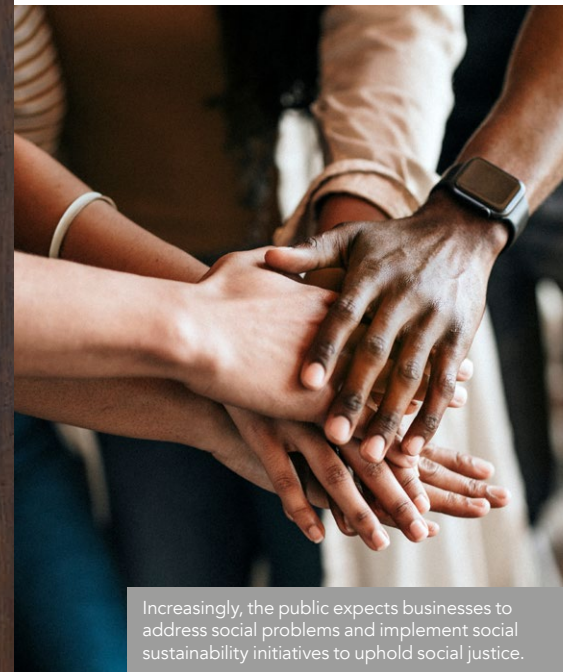
Increasingly, the public expects businesses to address social problems and implement social sustainability initiatives to uphold social justice.

MANY BUSINESSES, INCLUDING THOSE WITHIN THE HOSPITALITY INDUSTRY, ARE IMPACTED BY THE PERCEPTIONS CONSUMERS HOLD REGARDING HOW THE BUSINESS BEHAVES ON MATTERS OF SOCIAL SUSTAINABILITY.