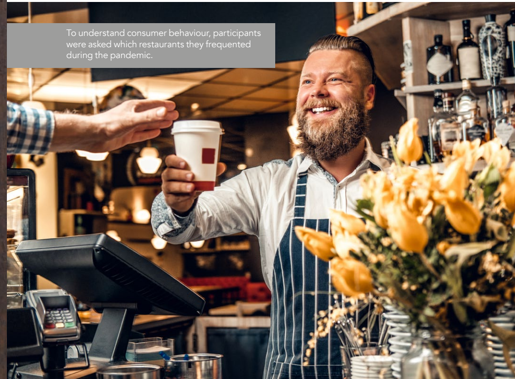
To understand consumer behaviour, participants were asked which restaurants they frequented during the pandemic.