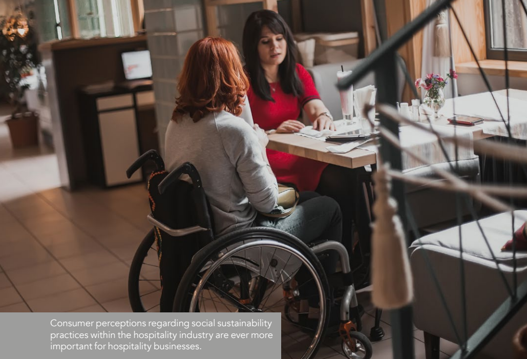
Consumer perceptions regarding social sustainability practices within the hospitality industry are ever more important for hospitality businesses.