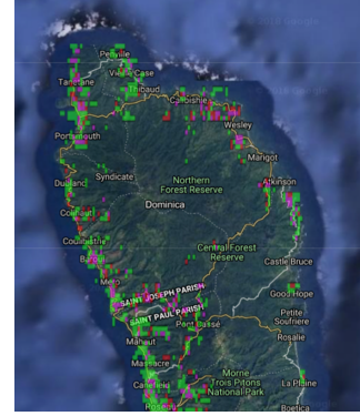
Figure 1: Heatmap of building damage proportion in Northern Dominica after hurricane Maria in 2017: less than 20% (green), 20% to 60% (magenta), greater than 60% (red).

Our algorithm has been developed and deployed in collaboration with Zooniverse and Rescue Global 2 , a UK based not-for-profit, to generate damage heatmaps for disaster responders by combining crowd labels of satellite imagery immediately following Hurricanes Irma and Maria (2017) [3, 4, 5] (see Figure 1) and earlier versions following earthquakes in Nepal (2015) and Ecuador (2016). These heatmaps were passed to the UN, FEMA and over 60 NGOs during the response phase of Irma and Maria in a timely manner. This work has led to several research projects in disaster management and environment protection in Africa, South East Asia and South America. Our Zooniverse project on mosquito detection has crowdsourced labels from more than 1200 citizen scientists on data collected in Thailand, Kenya, US and UK.