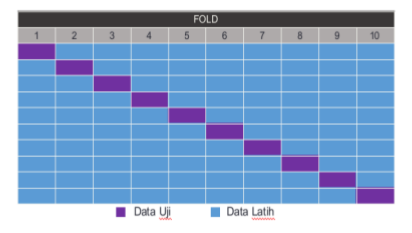
Figure. 5. Illustration of 10-fold cross validation

1) K-fold Cross Validation: Cross validation is a model validation technique to assess the accuracy of analysis results. Data that has been pre-processed is cross-validated by dividing the data into training data and test data for the classification process [7]. Data division was carried out using k-fold cross validation with a value of k equal to 10.