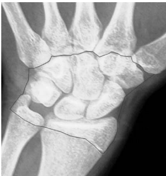
Fig. 1 An example of the carpal area selected using the polygonal lasso instrument of Adobe Photoshop 7 software

A simple linear regression model was considered to describe the relation between age and the ratio (Bo/Ca). Analysis of covariance (ANCOVA) was then applied to study how gender affects the growth of the ratio Bo/Ca in the boys and girls groups.