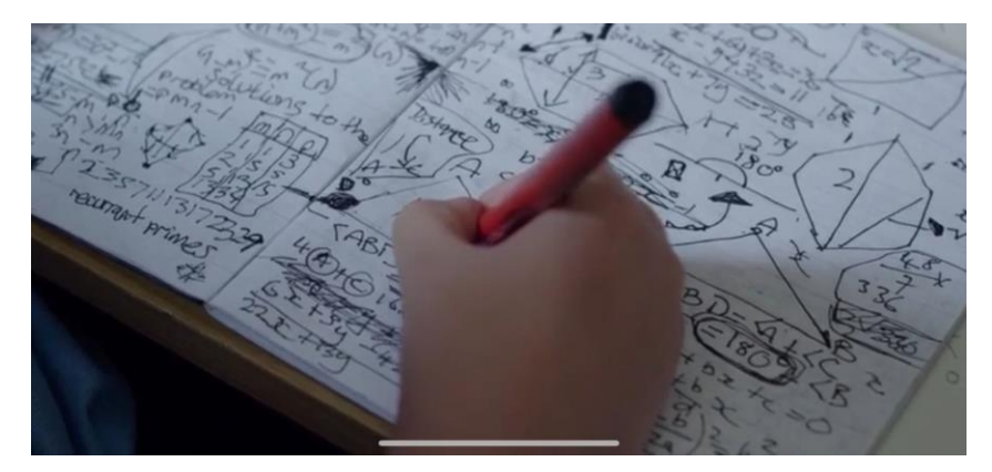
Figure 3, Nathan type about mathematic formulation in his book