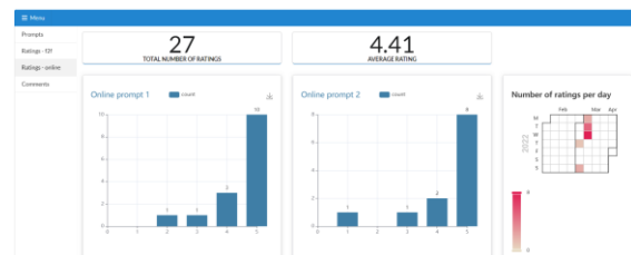
Figure 3: Prototype of teachers' dashboard providing real-time monitoring of student's responses

Prototype of teacher's dashboard has been also developed (Figure 3).