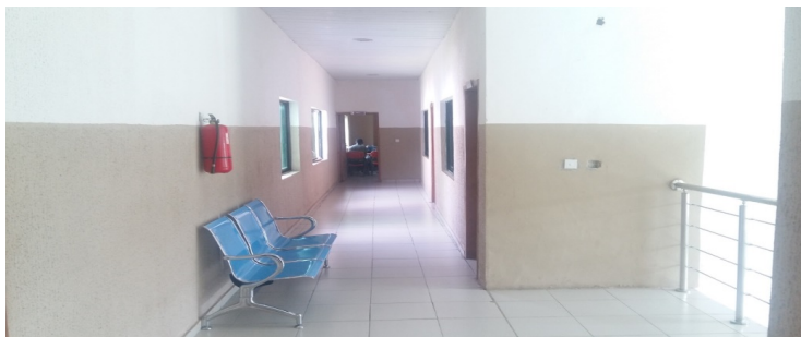
PLATE 3: Internal view

The interior of each of the spaces had access to natural daylight through the use of large windows which spans more than half the length of the space as shown in plates 3 to 5. Due to inadequate natural lighting, fluorescent bulbs are used consistently to enhance the brightness of the rooms.