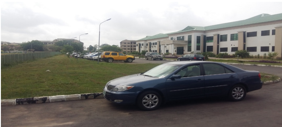
PLATE 8: Parking lot

There are eave projections in some areas especially along the restaurant extension, but they don't shade the windows, venetian blinds do from within. No horizontal or vertical shading device as shown in plates 9 to 10 respectively.