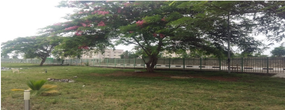
PLATE 7: Landscape