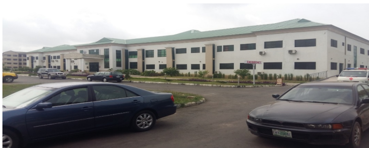
PLATE 1: Approach view

Some sustainable design strategies were applied to the building elements. The building envelope and its components are key determinants of the amount of heat gain/ loss and wind that enters into a building. The dominant building material used are concrete and glazing (reflective glasses) for walls, marble tiles for floor, white patterned suspended ceiling in some spaces. Variety of colours were used in different spaces within the building: milk coloured walls for the library, auditorium, and seminar rooms respectively, dark and light blue coloured walls for the mini halls, orange and milk coloured walls for the foyer and light and dark shades of green coloured walls for the restaurants as shown in plates 1 to 3.