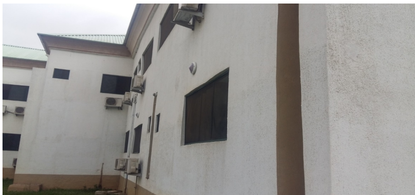
PLATE 6: East View

Natural ventilation was provided for through the use of large windows some of which are openable as seen in plates 3 to 5, however they were not adequate, hence the functional spaces within the conference centre made use of air conditioning systems as seen on 6.