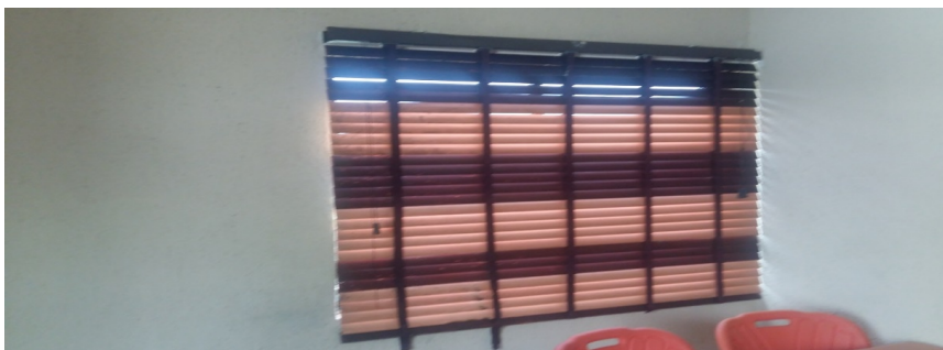
PLATE 4: Buttery/Restaurant Window blind

The interior of each of the spaces had access to natural daylight through the use of large windows which spans more than half the length of the space as shown in plates 3 to 5. Due to inadequate natural lighting, fluorescent bulbs are used consistently to enhance the brightness of the rooms.