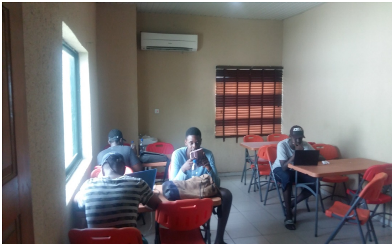
PLATE 5: Health Centre butterfly/Restaurant

Natural ventilation was provided for through the use of large windows some of which are openable as seen in plates 3 to 5, however they were not adequate, hence the functional spaces within the conference centre made use of air conditioning systems as seen on 6.