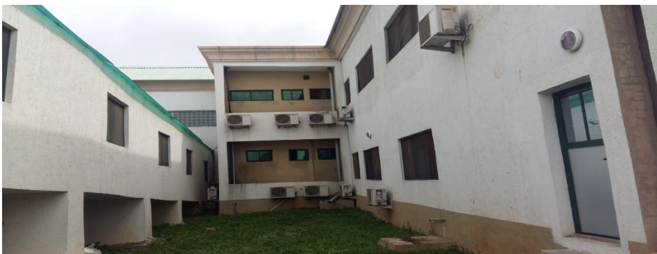
PLATE 9: East view showing eaves

There are eave projections in some areas especially along the restaurant extension, but they don't shade the windows, venetian blinds do from within. No horizontal or vertical shading device as shown in plates 9 to 10 respectively.