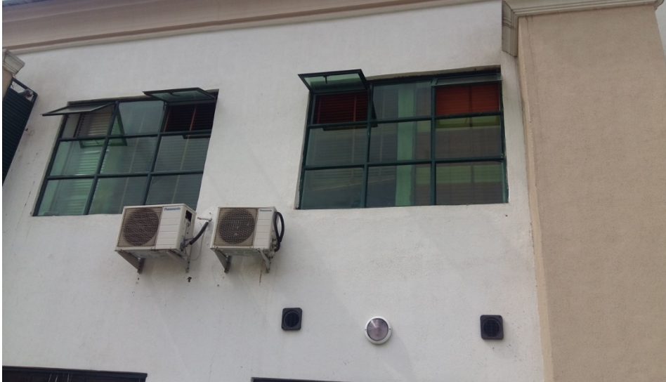
PLATE 10: Front View Windows