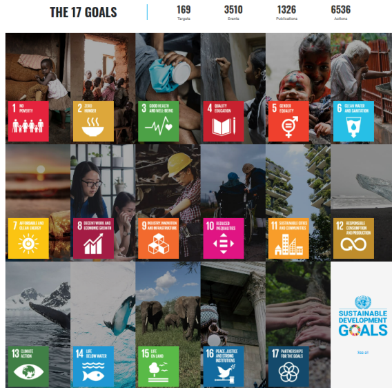
Figure 1. Sustainable Development

society, and strengthening the means of implementation and revitalizing the global partnership for sustainable development.