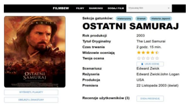
Figure 1: Example view from authors' interface.