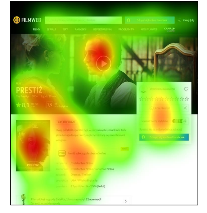
Figure 3: Heatmap for Filmweb interface examine scenario.