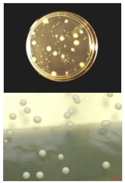
Figure 2. The dominant form of bacterial colonies of P. aeruginosa

A dose of irradiation will kill the microbial population present in a substance. The larger the bacterial population that is before irradiation, the more bacteria will remain after irradiation. According to Correa et al. 2019 irradiation inactivates bacteria by killing or inhibiting metabolic activity [9] The bacterial population decreases or does not exist at all with the increasing dose of irradiation given to the material [8][10][11]. The results data and the calculation of the number of bacterial cells per gram of talcum powder sample at various irradiation doses using the plate count method are shown in Figure 2.