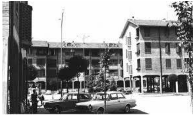
Fig. 4 | Rosta, Albini, Helg, Manfredini, 1956/61