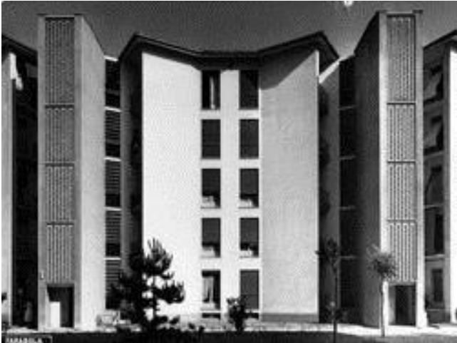
Fig. 1 | Cesate, quartiere Mangiagalli, Albini, Gardella 1950/52

Below we selected few images and examples of INA Casa projects that to give a photographic documentation of these neighborhoods. The images are extracted from the web.