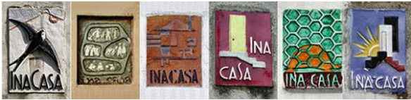
Fig. 2 | tags INA Casa