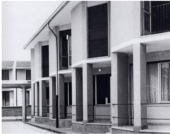
Fig. 3 | Cesate, BBPR 1951/54