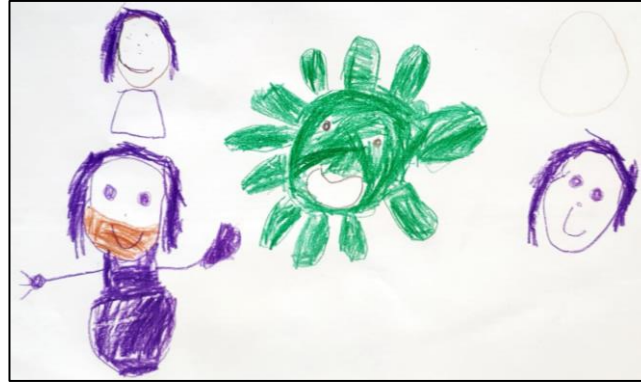
Picture 1. Drawing of students depicting coronavirus

the need for safety and love. On the other hand, it is seen that there are children who used red and black colors. The picture depicted by one of the students participating in the research is given in Picture 1.