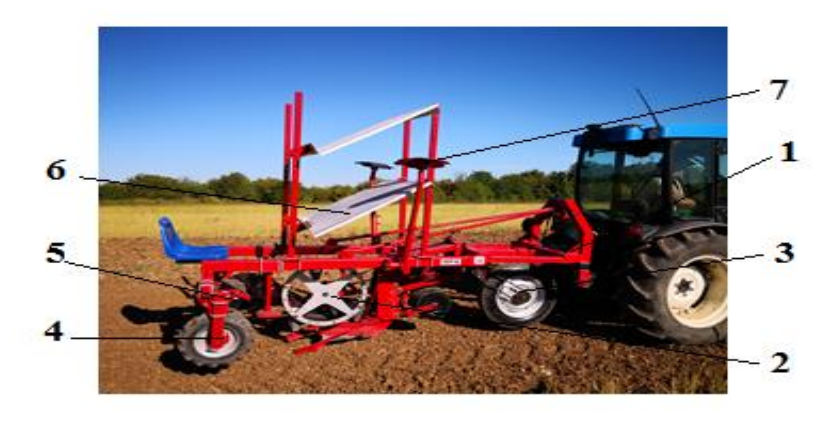
Fig.1. Machine for planting vegetable seedlings and herbs in a row, MPA symbol (**** INMA Bucharest, 2018) 1-Frame, 2- planter, 3- transmission, 4- rear support wheels,5-rcompaction wheels, 6- rack or crate holder, 7- track marker

To carry out the experiments, a planting machine was used in a row, equipped with a distributor with articulated cups, fig. 1.