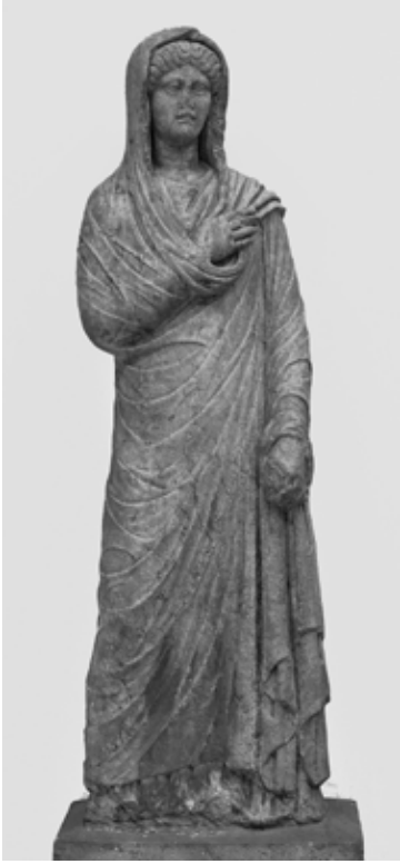
Fig. 2. Draped woman from Singidunum. Available at: http://www.narodnimuzej.rs/antika/zbirka-rimskog-carskog-perioda/ © National museum Belgrade, Serbia

prevailing [16, p. 6]. After the provinces were constituted, indigenous inhabitants were assigned to administrative units called civitates peregrinae . However, as A. Mócsy rightly points out, the territories of the civitates didn't always correspond with the size of the areas where certain tribes lived in the period before the Roman reign [16, pp. 68–69]. This had its consequences in the later diffusion of Roman culture, art and religion throughout Roman provinces of the Central Balkans.