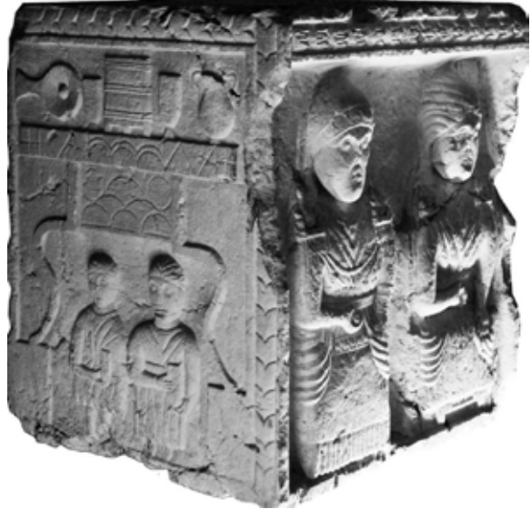
Fig. 5. Funerary monument from Seča Reka.

Particular influence of indigenous cultures on the sculptural and statuary works and compositions of the 2 nd and the 3 rd centuries can be observed on finds from the south-western parts of Central Balkans' Roman provinces, for example from the localities Kolovrat [1, pp. 227–231] and Komini (known also as Municipium S). The sculptures and reliefs from these sites bear striking iconographical similarities to the works of art from the surroundings of Salona in the coastal region of the province Dalmatia. Systematic archaeological excavations combined with the analysis of onomastics and material culture [14, pp. 227–234], showed that the iconographical and stylistic parallels between the sculptures and statues of two distant areas are the