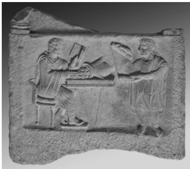
Fig. 3. Relief of a banker from Viminacium.