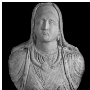
Fig. 4. Bust of a woman from Klokot. Available at: https://www.birmingham.ac.uk/schools/historycultures/departments/caha/events/2017/seminar-mladenovic.aspx © D. Mladenović

niche, from the 2 nd century [12, pp. 158–159, n. 163; 19, pp. 132–133, n. 6; 18, pp. 68–71] or the relief on the stela of a banker from the 3 rd century (Fig. 3). In Viminacium and a few other localities of Central Balkans' Roman provinces, funerary monuments with the images of genii of death with pedum and Attis tristis with pedum have been discovered, which are very similar to the images present on the numerous funerary monuments from eastern and south-eastern parts of the Roman province Dalmatia [6, pp. 111–127]. The monuments from Viminacium thus confirm strong artistic influence from the eastern parts of Dalmatia province, which was transferred from the coastal localities of Dalmatia to the interior of the province and then further to the major centres of Moesia Superior during the 2 nd and the 3 rd centuries. Onomastically too, migrants from mentioned parts of Dalmatia are confirmed in Viminacium and other localities of Central Balkans' Roman provinces [13].