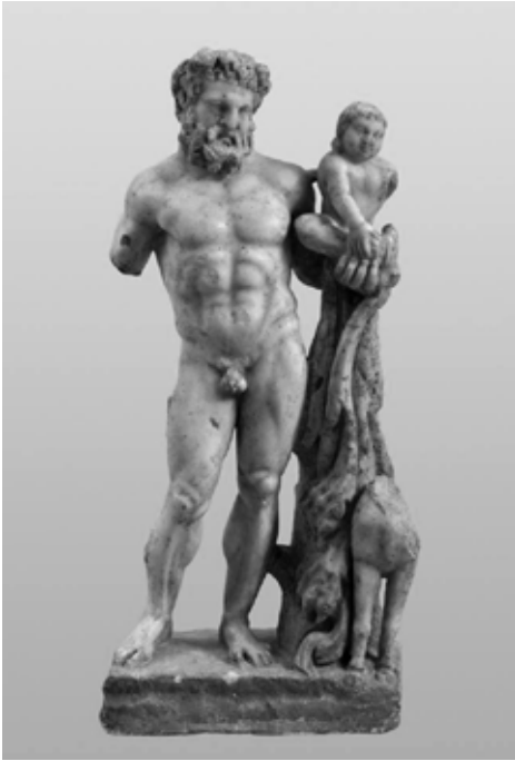
Fig. 6. Herakles with Telephos from Singidunum.

tral Balkans' Roman provinces. Their sculptors came from big centres in Greece, Italy and Asia Minor and established workshops in Central Balkans' Roman cities, like Viminacium, Singidunum, Scupi and imperial residences like Felix Romuliana and Mediana near Naissus. But in time a certain degree of iconographic syncretism can be confirmed in their output. The sculptures, however, which were produced on the request of the local elite and were made to adorn monumental public buildings, imperial estates and private villas of rich individuals, represent the highest artistic achievements of Roman sculpture of the time, inclining to the idealization of the image and beauty of the human body. This can be perceived in the head of Heracles found in the south-eastern part of the Jupiter temple in Felix Romuliana, probably modelled after the famous statue of Heracles Farnese [7, pp. 96–97, fig. 27], the head of an emperor from Karataš on Danube Limes (perhaps Albinus?) [23, pp. 30–31, fig. 7], Jupiter enthroned, with an eagle beside his left leg from locality Kostol (Pontes) [5, pp. 48–50] and Heracles with Telephos from Singidunum [7, pp. 95–96, fig. 23] (Fig. 6). The turbulent pe-