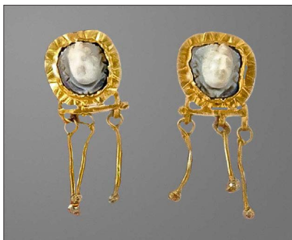
Fig. 16. Earrings with cameos decorated with Medusa's image, from Viminacium (Documentation of the Institute of Archaeology)