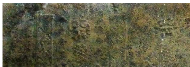
Fig. 4 and 5. Head end and longitudinal side of the lead sarcophagus with the depiction of railings and heads of Medusa, from Viminacium (Documentation of the Institute of Archaeology)

Сл. 4 и 5. Чеона и подужна страна оловној саркофага са представом ограда и с главама Медузе из Виминацијума (документација Археолошкој институције)