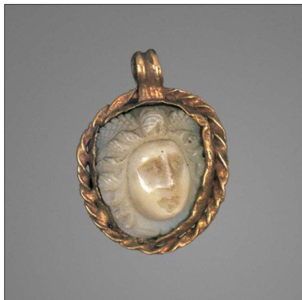
Fig. 12. Relief depiction of Medusa from Caričin Grad