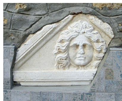
Fig. 19. Tympanum of Roman stelae as spolia in the Rukumija Monastery