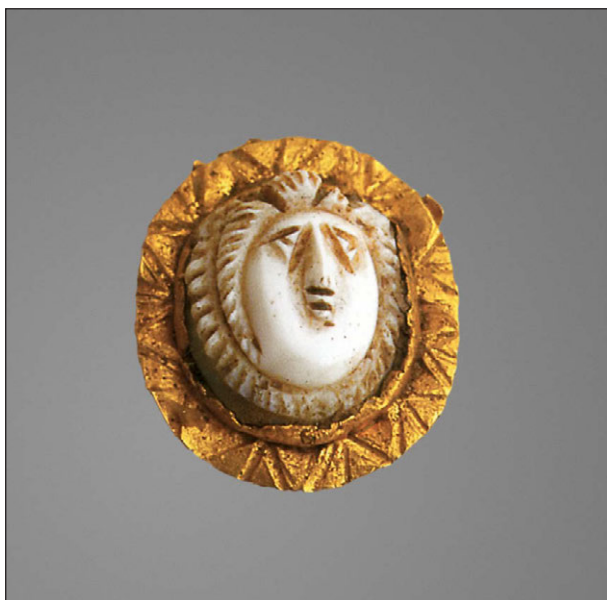
Сл. 13. Медалјон са камејом украшеном мотивом Медузе из Народног музеја у Београду (према: Поповић 1997, 44, с.л. 12)