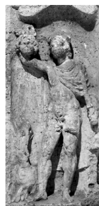
Fig. 1. Part of the funerary stela with Medusa depictions, from Viminacium (National Museum, in Požarevac)