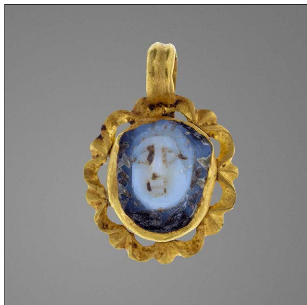
Fig. 14. Medallion with cameo decorated with Medusa motif, from the site of Margum (after: D. Spasić-Đurić 2003, 17)