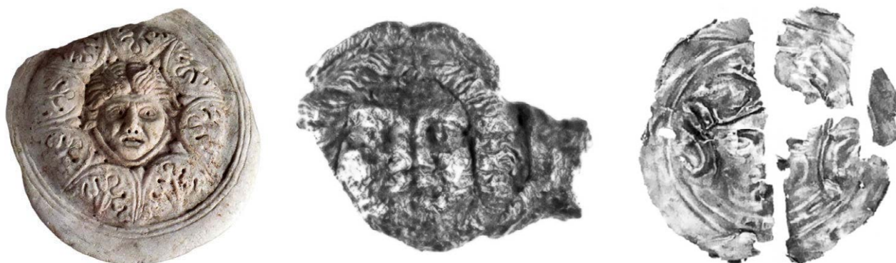
Fig. 7. Medusa's head as an umbo on a marble shield, Sirmium (after: Popović 2012, 77, fig. 8b)