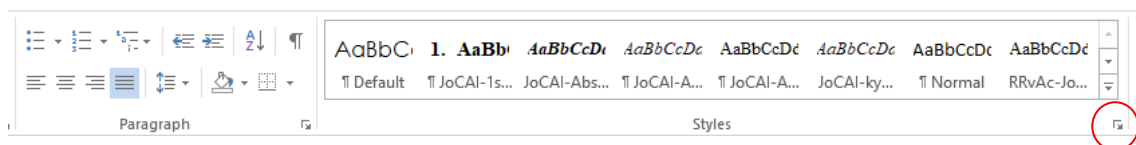
Figure 1. Style Menu in Toolbar

To set the style in whole manuscript, simply use this template and follow the instructions. We provide a number of predefined template styles, which can be accessed quickly and conveniently using the style menu in toolbar (see Figure 1). In order to format a paragraph, authors (writer) can click on the appropriate style name in the style toolbar.