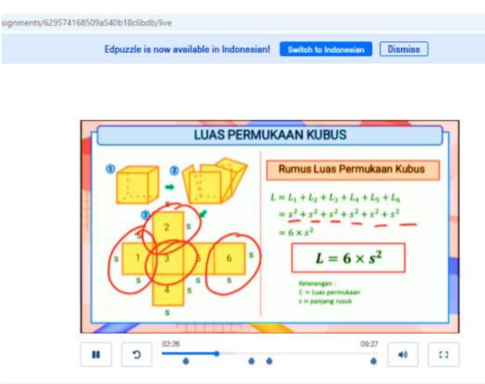
Figure 2. Learning material

reliable. Normality and homogeneity tests were carried out in this study's experimental and control classes.