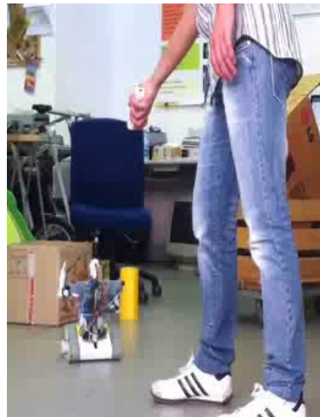
Figure 2: A picture of a phase of the RoboWII 2.1 game. The human player is shooting, with his WIIMote, at the robot, which is about to reach the target base, the yellow cylinder on the back.

RoboWII 2.1 is another PIRG requiring direct interaction. A 30 cm high robot should reach a target place to bring a secret message. The user can try to block it by facing it in a duel with a weapon that could be a pistol, a rifle, or a katana, all represented and actuated with different gestures of a WIIMote [4] sensor. On his side the robot can shoot at the player by evaluating the image of its camera. Depending on the result of the duel, the robot can decide to continue to its target, possibly confronting again with the player once the weapons are recharged, or to try to reach one of the friend's towers to recover safely from the got wounds. In figure 2 is reported a scene of the game.