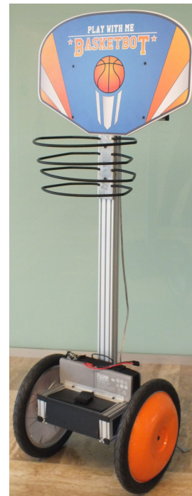
Figure 5: Basketbot, a mobile basket, implemented as a balancing robot, that interacts with the human player.

Other PIRGs, are under development to further study these aspects. Some of them are inspired to traditional videogames such as PAC-Man and Mario Kart, and put in evidence that timing in physical systems is different from timing in a videogame: physical interaction is generally slower, but more demanding in term of attention, so time has to be shared between the game conduction and the management of physical aspects. Other games are requiring physical performance, such as Basketbot (Figure 5), where an autonomous, mobile basket robot interacts with a human player that has to score a point by throwing a ball in the basket. Here, the game has to take into account also the fatigue of the player, possibly detecting it from the paying style. Actions, speed, and timing have to be tuned accordingly.