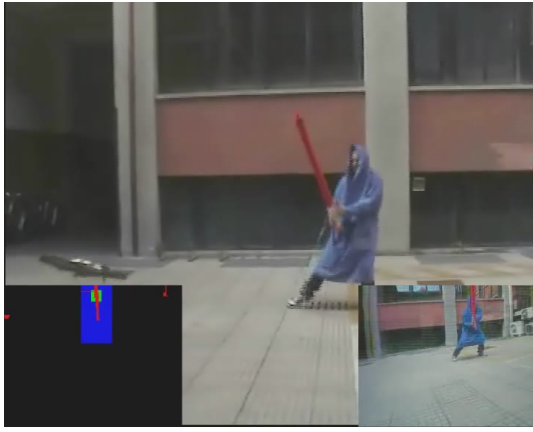
Figure 1: The drone and the Jedi trainee playing JediTrainer 3.0. On the bottom right the image taken by the on board camera, on the left the interpretation of the image in terms of color blobs. The green rectangle on the top of the blue one is the target where the drone is aimed at blast its laser shot.

The first timing consideration for this game has to do with the time from the shot to the evaluation of the image. Both the reaction time needed to perceive the laser blast sound, and the time needed to bring the light saber in front of the chest were considered. These gave an inferior limit to the time lag between shot and image capture for analysis. The superior limit was defined by considering that the parry action should come fast enough after the shot to be interesting: if the human player could take a lot of time to parry, the action would not be challenging, so not interesting, and the player would not be engaged, since the task would be evaluated as trivial. The time lag was related to the difficulty level of the game: the minimum (about 400 ms) was for the most difficult level, the maximum (up to 800 ms) was for the easiest one. These timing considerations can be considered as related to the performance .