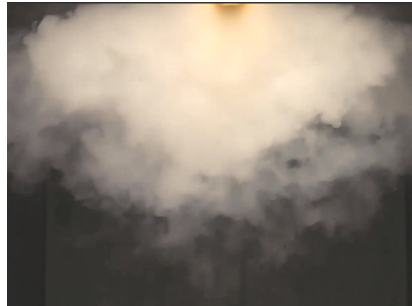
Fig. 1. Tests in the experimental blanket camera (experiment 1)

entire volume flow with the necessary speed. Most often, this method of air distribution is found in premises with mass stay of people and low ceilings (shops of different profile, cafe), and some production facilities with a limited amount of space.