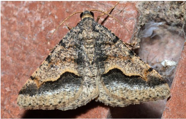
Fig. 1. Frederickia cyda (Druce, 1893), which FERGUSON (2008) designated as the type species of the genus Rindgea Ferguson, 2008.

These new combinations will be applied in the “Online taxonomic facility of geometrid moths” (see RAJAEI et al. 2022).