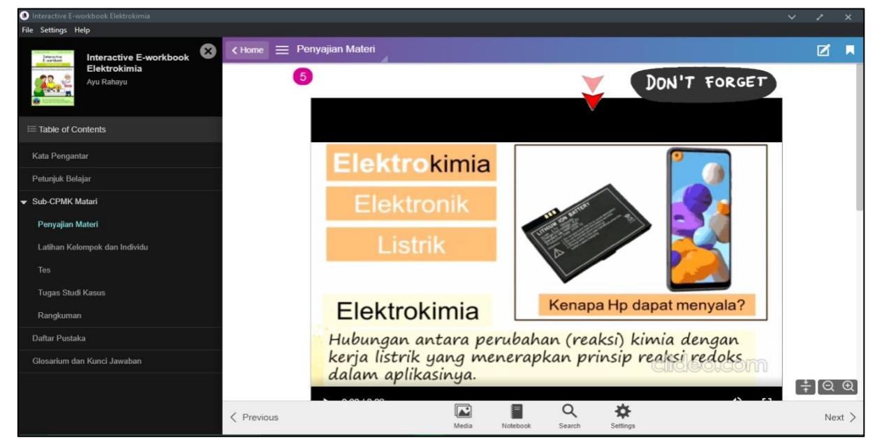
Figure 1. Initial Results of Interactive E-Workbook Development Using the Kotobee Authors Application

The initial development results using the Kotobee Authors application have been carried out in Figure 1.