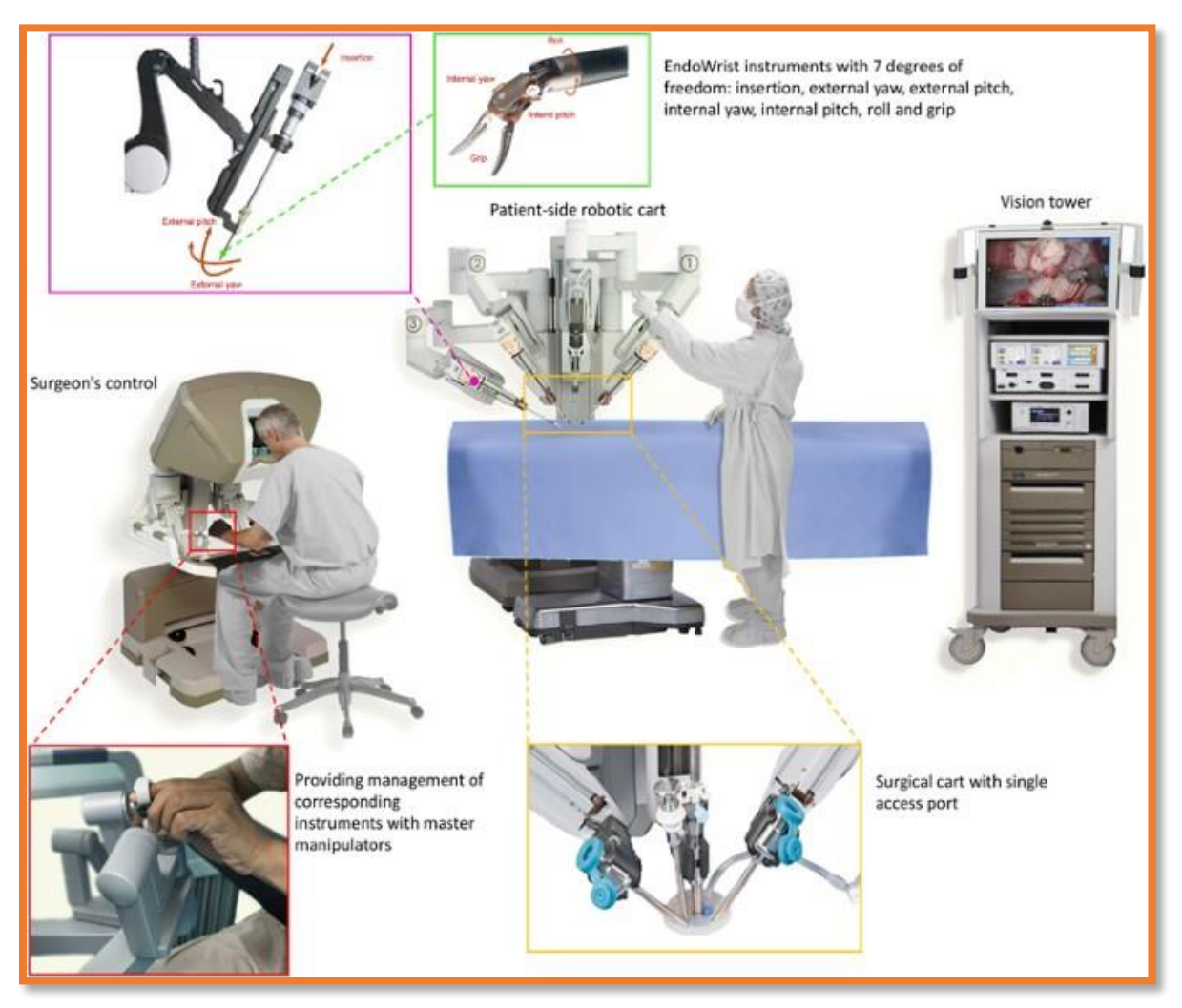
Figure 3: Robotic Cholecystectomy Surgical Process