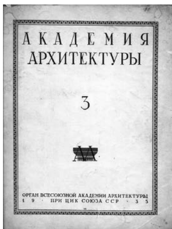
Figure 6-7. Akademija Architektury, 1935, № 3, Jurnal of Soviet Academy of Architecture

Despite the strong influence exerted by political events and decisions, the architectural climate under Stalin must be read also as a dense cultural project animated by extraordinary intellectual figures, among whom was Aleksander Gabričevskij 22 who subsequently fell victim to persecution. This cultural atmosphere reverberated tangibly on the pages of periodicals such as “Architektura SSSR”, “Akademija Architektury”, “Architektura za rubežon” 23 into the mid-thirties. Driven by research as well as a deep-rooted desire for