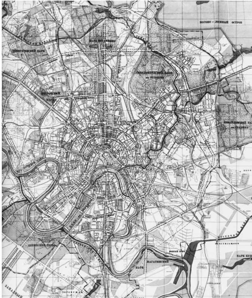
Figure 10. V. Semenov, Genplan Rekonstrukcii Goroda Moskvy, (General Plan of Moscow), 1935