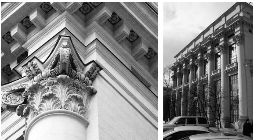
Figure 3-4. Ivan Žoltovskij, Dom na Mochovoj, Detail of Palladian order and main facade, 1934

Designed and built as these events were unfolding, between 1932 and 1934, the severe Palladian references of the “house on the Mokhovaja” by Ivan Žoltovskij 14 – a connoisseur of the Italian Renaissance and an established master prior to the Revolution – stood as a provocation to the aesthetics of the avant-garde that had been all the rage until shortly before but that were rapidly losing consensus amidst the changing scenario. The Dom na Mokhovojs erudite re-visitation and re-elaboration of the Loggia del Capitanio in Vicenza – in line with the most rigorous Russian Classicism developed in St Petersburg in the 1910s (such as the Markov residential building by Vladimir Ščuko 15 ) – with its columns masterfully executed in the giant composite order punctuated by large vertical windows, was a statement to the vitality of Soviet architecture and its ability to respond to the unprecedented tasks required of it. Set apart from the neighbouring buildings by two lateral sections set in from the other facades, as if to underline its exemplary character, Ivan Žoltovskij's work provided a