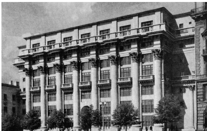
Figure 2. Ivan Žoltovskij, Dom na Mochovoj, 1934

Following the 1930 campaign launched against the more radical fringes of architectural research catalysed by the personality of Ivan Leonidov (the so-called leonidovščina 12 ), these measures 13 were soon backed by a series of directives,