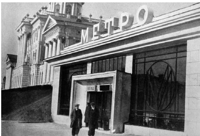
Figure 9. Entrance pavilion to the subway station of Ul. Kominterny (Lenin Library), 1935

The Moscow underground 29 , which in the 1930s ranked as the regime project par excellence , was designed and built as the new currents were developing and consolidating their terrain. Indicated as a benchmark experience in the Socialist Realism research, the work remains a highly eloquent example of those times. From Ivan Fomin's employment of the so-called "red Doric" simplified and modernised neoclassicism 30 to Nikolaj Ladovskij's 31 work as one of the leading exponents of the Rationalist avant-garde, or the stations