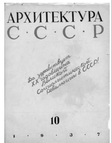
Figure 8. Architektura SSSR, 1937, № 10, Jurnal of the Union of Soviet Architects