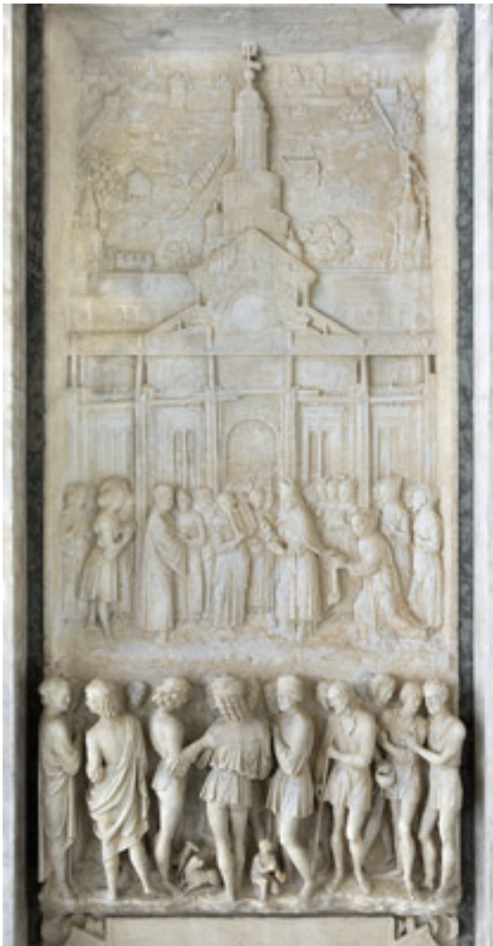
3. Benedetto Briosco, 'The Consecration of the Certosa di Pavia'.

This earlier project also appears in Bergognone's fresco for the right transept of the Certosa, 'Gian Galeazzo Visconti offers the Model of the Certosa to the Virgin and Child' (fig. 2). In this fresco, the façade of the church is shown complete. Borlini has pointed out that the two rows of arcades above the central oculus (the lower one not yet built, and the upper one modified later, but located at the same height as in the actual façade) appear in the 'Virgin and Child' and in Benedetto Briosco's 'The Consecration of the Certosa' (fig. 3). This sculptural relief was made for the door of the Certosa between 1501 and 1506, but it illustrates an event that took place several years earlier, in 1497. 6