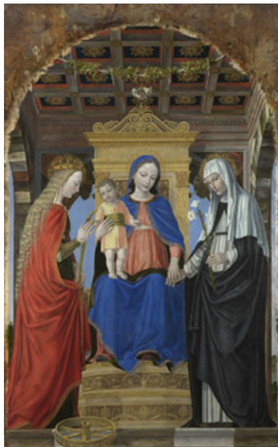
1. Ambrogio Bergognone, 'Virgin and Child with Saints', about 1490, NG298.

Many scholars date the 'Virgin and Child' to between 1488 and 1490, on the basis of Bergognone's documented presence at the Certosa, and the known building phases of the church's façade. 1 According to Albertini Ottolenghi, Bergognone is first recorded at the Certosa on 28 February 1489, 2 although it is possible that he had been working at the monastery since the second half of 1488. His extensive work at the Certosa consists of two polyptychs for the altars of the church, four altarpieces documented in 1490 (including the National Gallery's ' Virgin and Child with Saints ', fig. 1), and four more, recorded in 1491 and between 1492 and 1494.