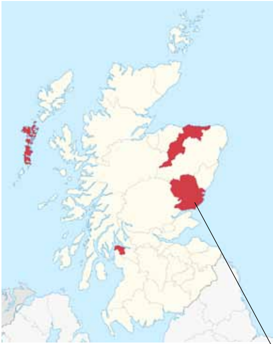
Fig. 1: Map of Angus showing Dundee