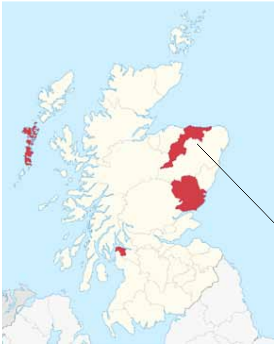
Fig. 4: Map of Aberdeenshire showing the Banffshire Coast