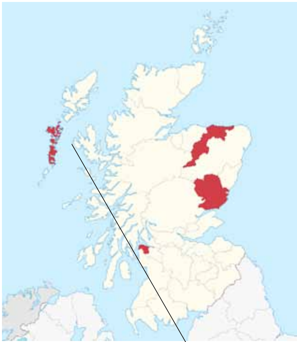
Fig. 5: Map of the Western Isles showing the Uists