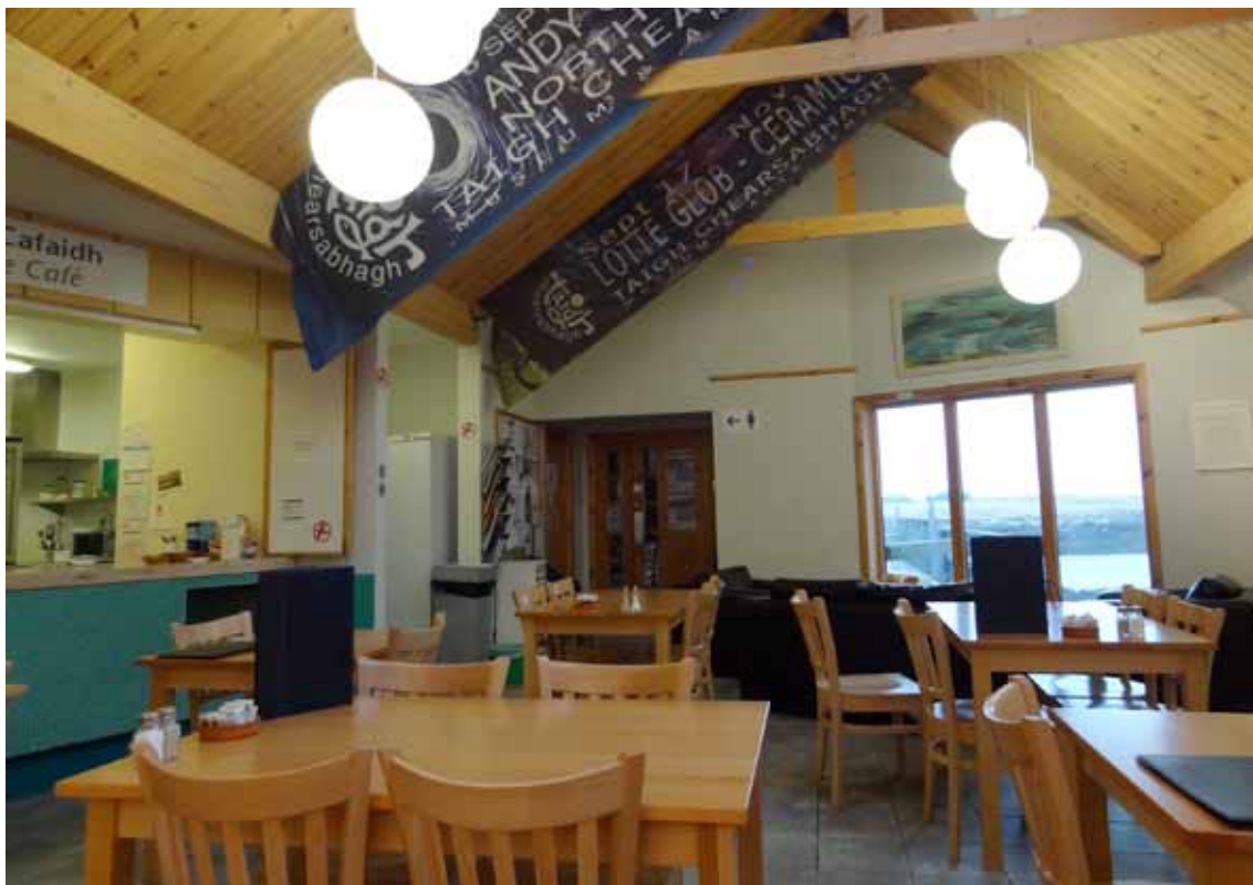
Above and opposite: Taigh Chearsabhagh Museum and Arts Centre

and Harris, creating an event such as this would provide an incentive for the normally transient visitors to the Uists to stay and contribute to the local economy. Stakeholders working for different arts centres (e.g. An Lanntair, Taigh Chearsabhagh) in the region expressed a strong desire to improve communication and collaboration between one another, further contributing to this possibility. Lastly, it would be important to have a programme that predominantly showcases local musicians while also featuring acts that will interest both visitors and locals alike – this will help to ensure that local support is maintained for the event. It would reduce the sporadic nature of current performances by formalising them, although keeping the local authenticity because of the brevity of the programme duration. Ceòlas would likely play a central role in the proposed event as it is major organiser and promoter of traditional music and culture in the Uists while the Taigh Chearsabhagh cultural hub would be a key venue.