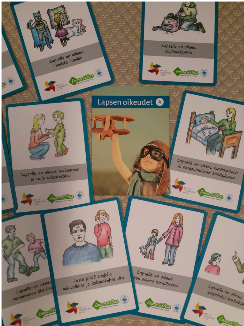
Photo 1. Children's rights cards.