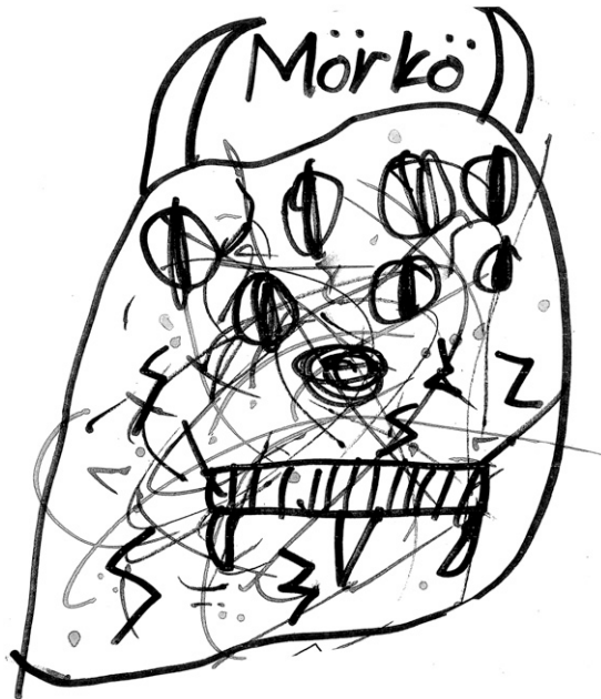
Drawing 1. The Bogeyman.