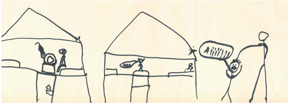
Drawing 2. Devil.

[My brother] is afraid every day when he comes home. (Girl, 12 years)