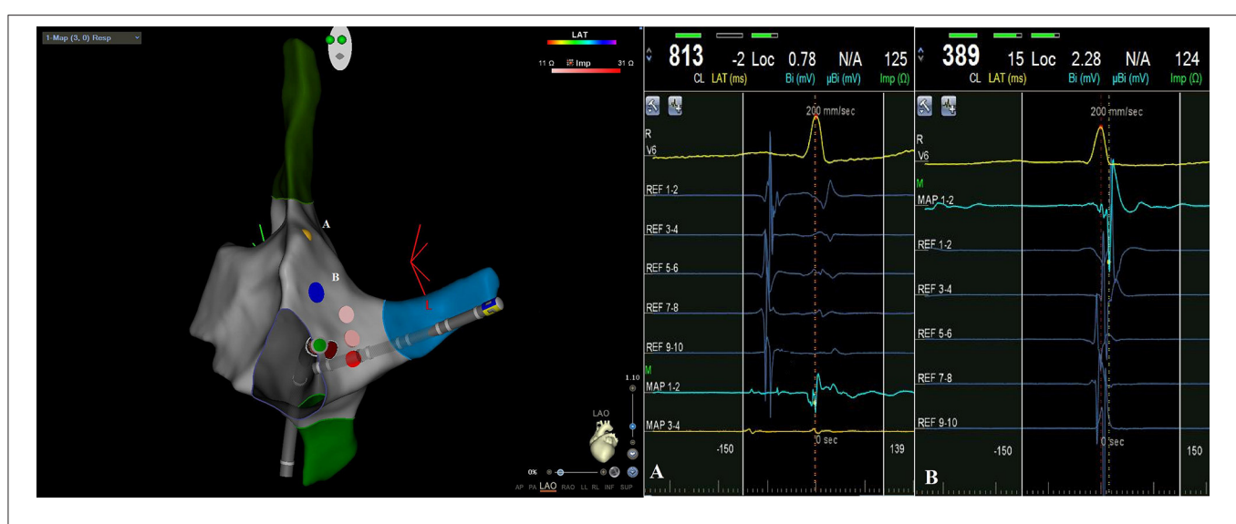
FIGURE 1 | CARTO3 left anterior oblique (LAO) image of atrioventricular nodal reentrant tachycardia ablation: during radiofrequency applications catheter remains below tagged His potential [yellow point A on EAM, intracavitary signal (A)] and fast way potential [blue point B on EAM, intracavitary signal (B)].

with fast anatomical mapping software with the aim of defining endocardial boundaries, tagging the area where a His bundle deflection was recorded, reproducing in detail the tricuspid annulus, and reconstructing the coronary sinus up to its distal portion. Finally, we advance the other diagnostic catheters, if needed, using the previously reconstructed venous and atrial geometry. The same technique is used for arterial access in case of a retrograde approach for left PVC, AP, or VT ablation.