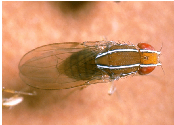
Figure 1: Zaprionus indianus adult

The EPPO code 1 (Griessinger and Roy, 2015; EPPO, 2019) for this species is: ZAPRIN. (EPPO, online).