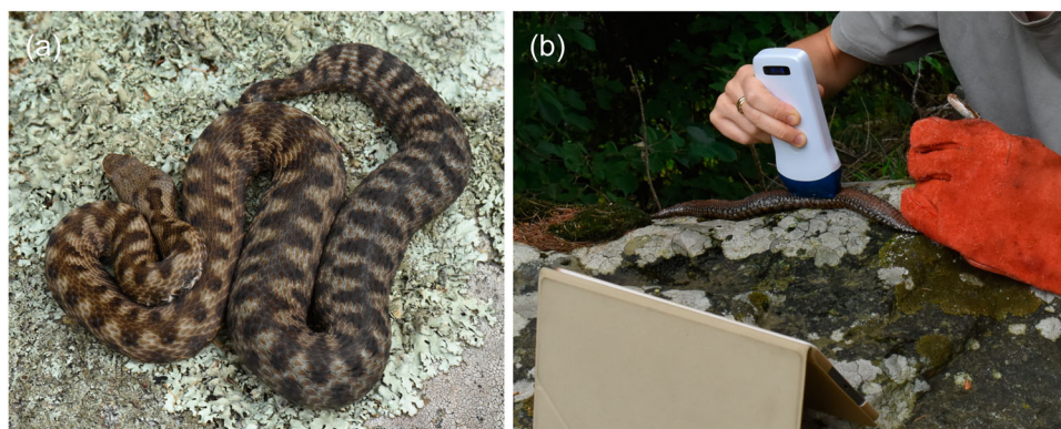
FIGURE 1 Ultrasound examination of vipers ( Vipera aspis ). (a) One of the gravid females that were investigated. (b) In-the-field ultrasound scanning of a gravid viper. Females were examined shortly after capture and then released at the exact capture site.

We remark that detailed recognition and quantification of individual embryos was easier at the earlier stage that we investigated, due to the higher abundance of yolk revealing individual