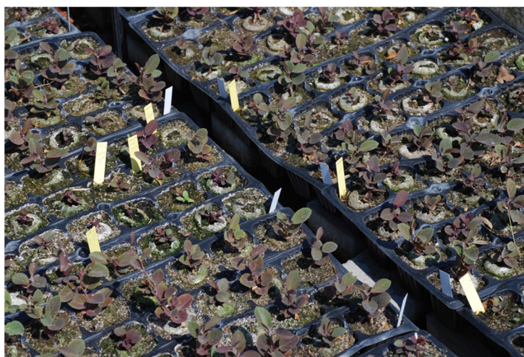
Figure 3. Experiments in seed propagation carried out in Spain at CITA by using seed of capers from Ballobar (Aragon, Spain).

stratified, opportunely moistened sand layers, each 2–4 cm high. This process takes 25 to 50 days and generally leads to a 30–40% pre-germination rate. The full emergence of the plantlets (45–50 out of the initial 250–330 pre-germinated seeds) occurs 25–30 days after sowing. Simplified direct seeding with 4–5 g seed m -2 is also reported, but with lower results in terms of plantlet emergence, with the best expectations of 30–40 plantlets m -2 .