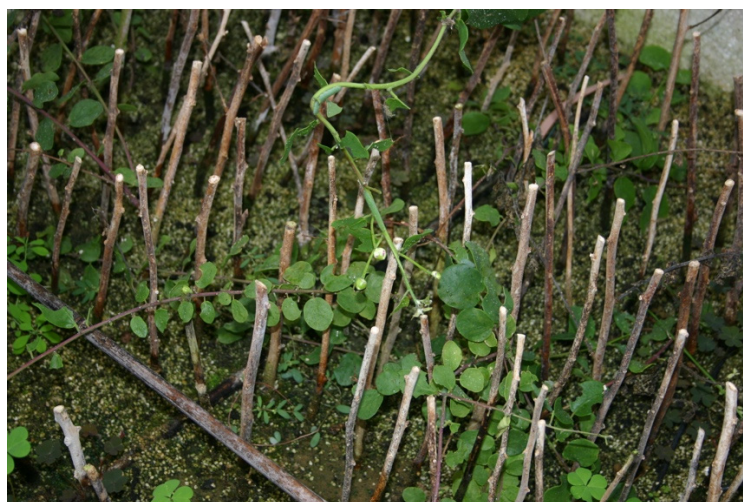
Figure 4. Vegetative propagation by rooting during experiments at the University of Palermo, Italy.

Variation in the rooting potential of caper cuttings has been generally reported as affected by the type of cutting, cutting harvest time and by the PGR and substrate utilized [73,74]. In Italy, dipping the basal end of the cutting into 1500–3000 mg L -1 IBA solution enhanced rooting, depending on the type of cutting and the season in which cuttings were taken, with rooting percentages under mist propagation or heated bed systems between 55% and 75% with hardwood cuttings taken in March–April, corresponding to the initial bud-break phase [75,76]. On the other hand, herbaceous (softwood) cuttings, taken at the beginning of the vegetative cycle (April), showed more satisfactory results, with 90% rooting success, in the case of spineless caper biotypes rather than with spiny ones [77]. Cutting diameter has been generally reported to be determinant for the result in various studies [16,37,78] and, ordinarily, the best results have been achieved with values at least 5–6 mm or even higher, and not below 3 mm, for hardwood and softwood cutting, respectively. A positive correlation between cutting diameter and rhizogenesis success has been reported for hardwood and semi-hardwood cuttings, as well as a positive effect of sealing the top- and the bottom-end of cuttings with paraffin [46].