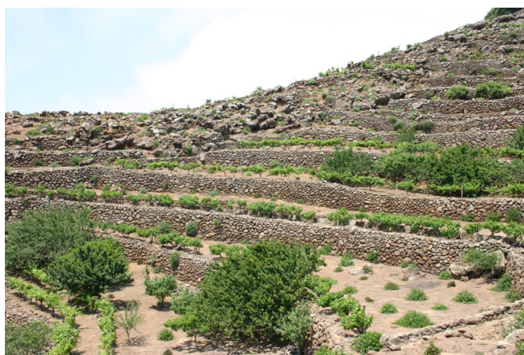
Figure 1. Traditional caper orchard on the island of Pantelleria, where sloped lands in ancient times were managed in order to obtain comfortable terraces.

cultivation is not able to meet the thriving market demand [6]. In Italy, caper cultivation, based upon local selections or biotypes [16] of C. spinosa L., domesticated in situ from subsp. rupestris [17], is concentrated in the small islands around Sicily (mostly Pantelleria and the Aeolian Islands Salina, Lipari and Filicudi). In these Sicilian areas, the species plays a significant socio-economical role [18,19] and was awarded in 1996 with the designation of UE “Protected Geographical Indication” (PGI) for the caper grown on the island of Pantelleria (Figure 1), and more recently (2020), for that on the Aeolian archipelago, by EU “Protected Designation of Origin” (PDO-IT-20A02570), under the denomination of “Cappero delle Isole Eolie Dop”. On the Aeolian island of Salina (Figure 2), a Slow Food Presidium has been active for many years, with the aim of preserving a heritage of cultural and agronomic knowledge linked to the island’s history and the resilience of its heroic agriculture [20].