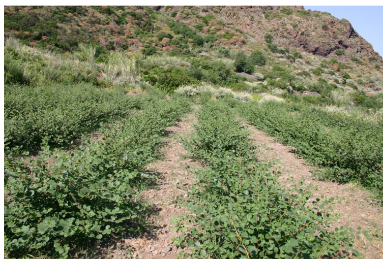
Figure 2. Intensive caper orchard on the island of Salina.

Well adapted to harsh environmental conditions [21], due to its xerophytic habit and its deep root system [22,23], its exceptional photosynthetic characteristics, maintained under high irradiance and temperature without damage symptoms [24], and its adaptation to poor soils [25], C. spinosa L., could, therefore, significantly contribute to the development of local, marginal areas [21], especially those of small islands. Additionally, caper may help preserve the equilibrium of fragile arid and semiarid ecosystems [26] by reducing the soil erosion