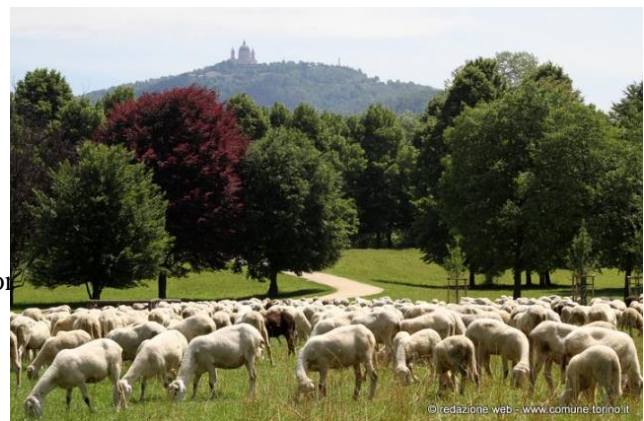
Figure 1. Biosphere Reserve CollinaPo with 14 core zones (for agricultural processing)