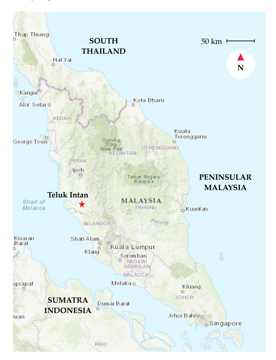
Figure 1. Map of Peninsular Malaysia showing the location of Teluk Intan (red star) within the State of Perak. Accessed on 13 May 2019 from https://landsatlook.usgs.gov/viewer.html.

Analyzer, Beckman Coulter, CA, USA). Assessed biomarkers included C-reactive proteins (CRP) (Immune Quantitative Analyzer) and procalcitonin (PCT) (Procalcitonin Rapid Test Kit, Easy Diagnosis Biomedicine Co., Ltd., Wuhan, China).