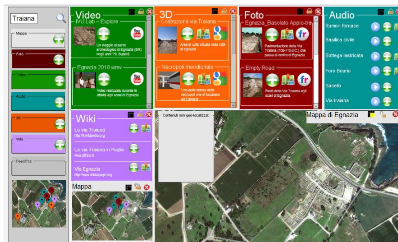
Fig. 2. The customization of the composition environment for supporting the activity of the professional guides at the archeological park of Egnathia [6].

Based on the registered services, end users, by means of a Web composition environment and through visual mechanisms suitable to their background and domain, compose contents, functions and visualizations. Figure 2 reports the customization of the composition environment for the guides of the archeological park of Egnathia [6]. The workspace composition proposes a map-based visual template to allow the guide to associate the content retrieved through services to specific locations of the park. The content is visually presented in different resource windows , each one associated to a specific service. The users select content items from such windows and, through drag&drop actions, associate them to points on the map. The result of such composition actions is immediately shown to the user, who can thus realize how the final application will work, and iteratively modify it, adding or dropping service items, until the desired version of the composite application is reached.