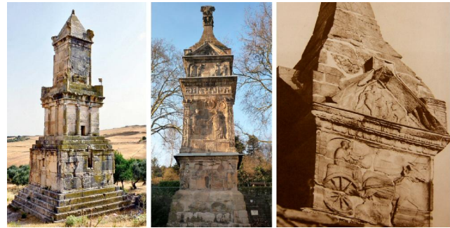
Figure 3. a) Dougga, Tunisia b) Igel, Germany c) detail with chariot.

above the other gods and humankind, but closely linked with them.