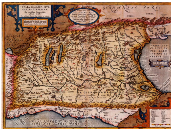
Figure 4. Gens Cassia or rather Gallia Togata.

Essentially, the pre-roman country was organized to equidistant points located at a distance from each other always between 30 and 35 km (example: Cavaglià <= 29 km => Vercelli <= 35 km => Vigevano <= 30 km => Milan (Duomo) <= 29 km => Cassano d'Adda <= 31 km => Urago d'Oglio (location called Montagnina dei Frati) <= 31 km => Brescia). The "castles", later called Castrum , for the protection of the points of tolls collection, were usually placed exactly in the middle and - in the area between Bergamo and Brescia - the town called Castrezzato is an example. Throughout the country of the gens Cassia was organized on this pattern: we can mention as further example, the route Milan - Avignon, itinerary, which shall remain in use until late 1500: Milan <= 30 km => Vigevano <= 35 km => Casale Monferrato <= 35 km => Asti (roman "Municipium" known as Hasta Pompeia ) <= 30 km => Chieri (the Roman toponym of Carrea Potentia , handed down by Pliny the Elder ) <= 35 km => Avigliana (in Latin Villiana which was, in Roman times, the boundary between the ager taurinensis , point of toll collection called quadragesima galliarum , namely the toll on goods coming from Gaul).