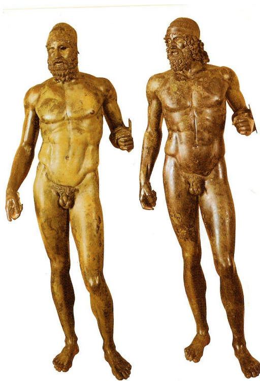
Figure 2. Riace bronzes.

ence to the two Dioscuri, Castor and Pollux - always represented with a horse and even on the back of coins ( quinar-ius ) which were spread in the second century BC: gens Cassia had as symbol Castor and Pollux with their two horses: Dioscuri [name indicating two Kouroi or two male statues without clothes (from singular Kuros , standing male statue)] the two “ kouroi ” were always represented with a small metal helmet ( cask , in Latin cassis ) while with one hand holding a spear and the other one holding the reins. Even the two very famous Riace bronzes were two “ kouroi ”.