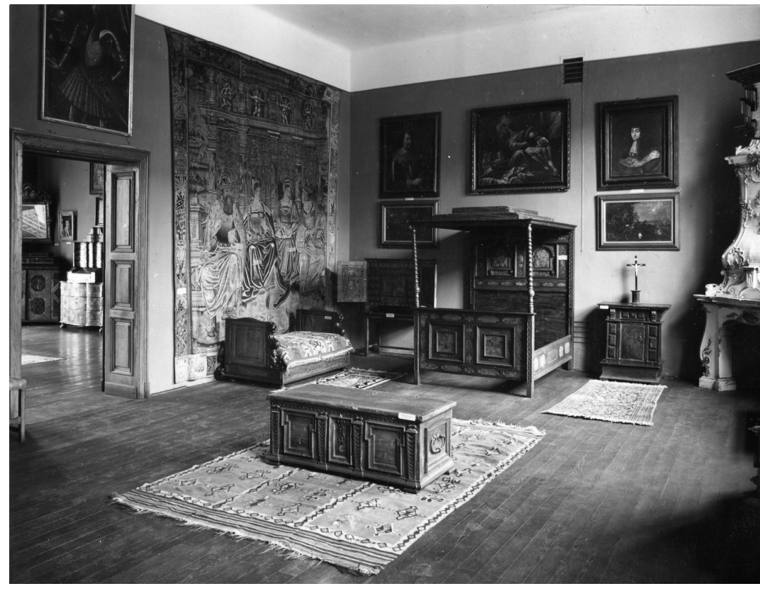
Picture 2. Display in the Renaissance Room, Permanet Display of the Museum for Arts and Crafts, 1937/38, MUO F 5213

Museum's Photo Gallery – from 1937/1938,<sup>35</sup> 1939 and 1946,<sup>36</sup> based on which it is possible to partially reconstruct which objects were exhibited when and where.