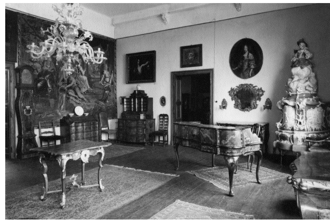
Picture 3. Display in the Baroque Room, Permanet Display of the Museum for Arts and Crafts, 1937/38, MUO F 5215

the note with the attribution and dating of the rug: "Persian Ferahan rug, circa 1800". Based on a comparative analysis of the photographs of the 2nd floor gallery, it was concluded that the objects in the exhibition were substituted after a year or two, i.e., that Vladimir Tkalčić had already applied the museological concept today termed "collections in motion". Carpets and rugs were also displayed in the 2nd floor gallery as part of the 1947 permanent exhibit (Fučkan 2022: manuscript), but there are no preserved photographs of that display.