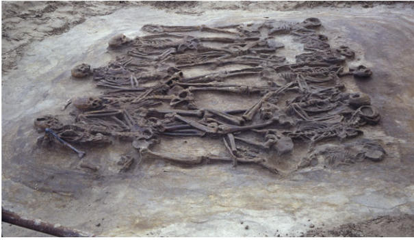
Figure 1. Violent intergroup conflict in humans. The burial at Wassenaar contains the remains of 12 people possibly murdered during an out-group raid on their settlement (approx. 3400 BP; reproduced with courtesy of Dr Louwe Kooijmans and Faculty of Archaeology, Leiden University).

social fishes [28]. Social insects raid neighbouring colonies and kill enemy conspecifics [29–33].