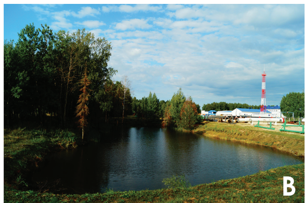
Figure 2. The localities with the anomaly P from Mari El Republic (Russia): A. Pond near Gusevo village; B. Pond near Medvedevo settlement.