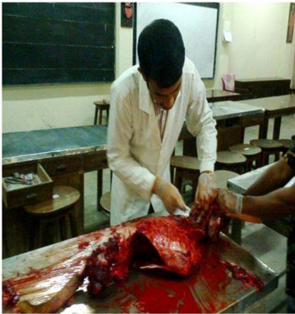
Fig.1: Skinning, Evisceration, and Separation of different body parts.

Separated the animal body into different parts: fore-limb, hindlimb, skull with vertebrae, ribs & sternum, and pelvic bone (Fig. 1). Fore-limb, hindlimb, and pelvic bone are packed in a nylon mesh with an identified marker to avoid mixing. A thin wire (1 mm) was driven through the vertebral column to the skull to keep the natural order of vertebrae from skull to tail. Ribs and sternum are tightly knotted serially by a copper wire (0.5 mm) in situ position of the skeleton and gently pulled away from the backbone.