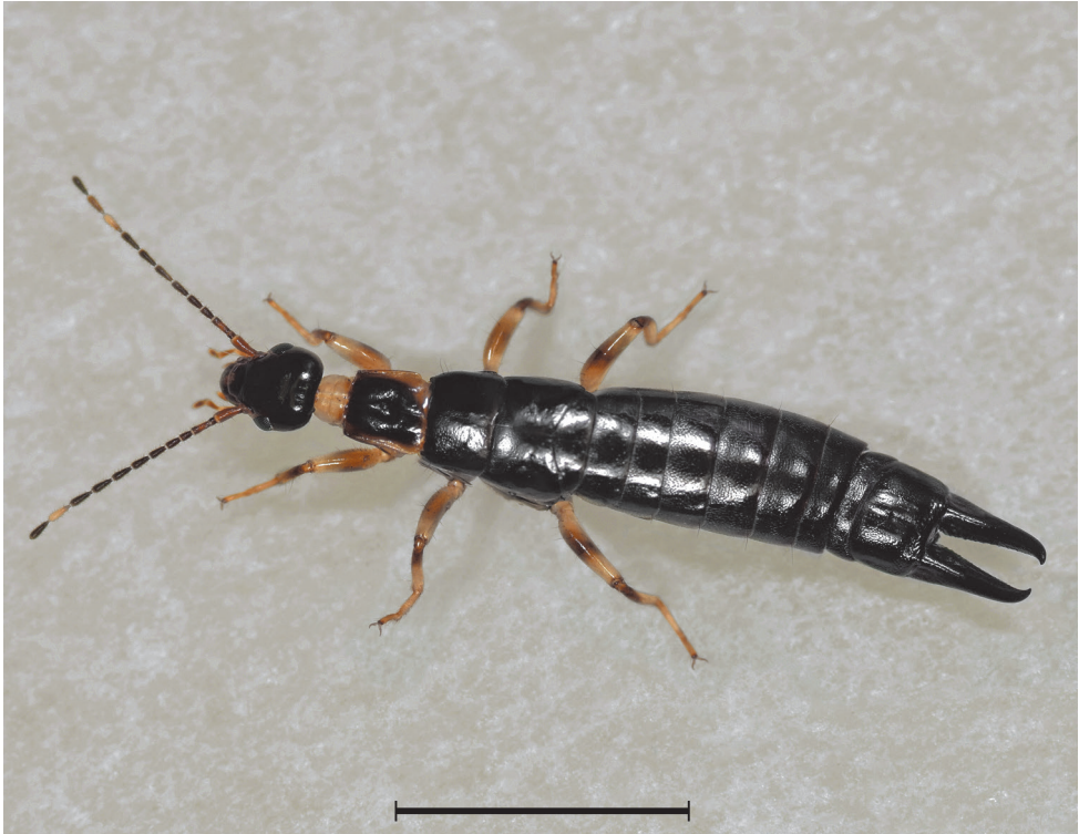
Figure 2. Ring-legged earwig, Euborellia annulipes (Lucas, 1847), collected from the Jevremovac Botanical Garden in Belgrade. The scale bar is 5 mm.

The up to date checklist of Dermaptera of Serbia contains eight species from all four families occurring in Europe (Anisolabididae, Forficulidae, Labiduridae and Spongiphoridae). Taxa whose presence in Serbia has not been confirmed by recent findings are marked with an asterisk (*).