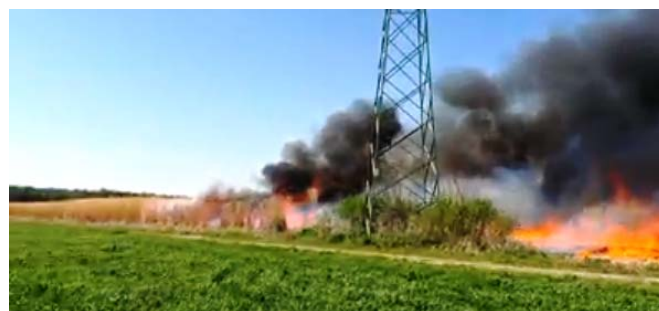
Fig. 4. Majur near Šabac, Serbia: A fire in April 2020, on a plot under Miscanthus , was caused by the negligence of the tractor driver.

At moisture content above 25% in bales, the self-heating of stored material can occur, with the risk of spontaneous combustion in the absence of ventilation. The bales with lower density ( <250 \text{kg m}^{-3} ) can be stored without fear of self-heating (El Bassam and Huisman, 2001). The bales with higher densities and limited airflow are subject to self-heating.