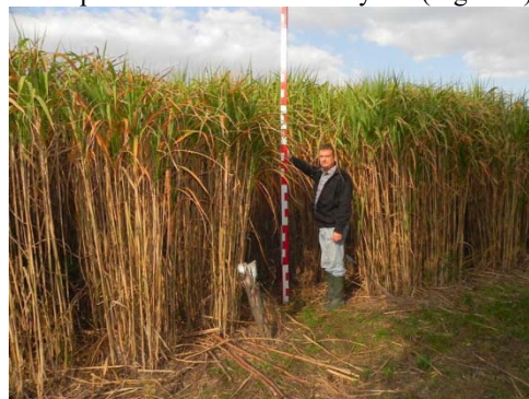
Fig. 1. Miscanthus × giganteus (Experimental field in INEP, Zemun)

of all, possible water deficits and possible extreme weather conditions. Besides, some parts of Serbia are considered steppe areas (Banat, Eastern and Southern Serbia), which are considered partly appropriate for Miscanthus growing (Dželetović et al., 2013a). In contrast, the short-term wetting (a two-week flood) does not cause visible damage to the Miscanthus crop and does not affect the yield (Figure 2).