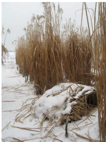
Fig. 3. Breaking of Miscanthus stems caused by load of big snow blanket.

(5) Crop diseases and pests. Miscanthus is sensitive to pests and diseases in the areas of Asia, where it occurs naturally. In Europe, there were no reports of plant pests and diseases that significantly limit the productivity of Miscanthus (Cosentino et al., 2012), which is more favourable than the situation with forest crops of short rotation, such as willow and poplar (Karp and Shield, 2008). Potentially, the risk can be pathogenic fungus infections, virus diseases, leaf lice, common rural moths, larvae of ghostly moths, plant lice and parasite nematodes.