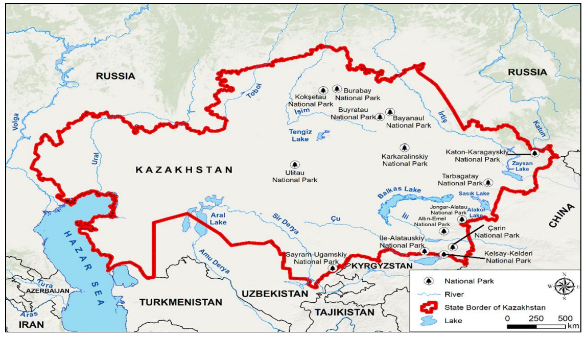
Figure 1. Kazakhstan National Parks