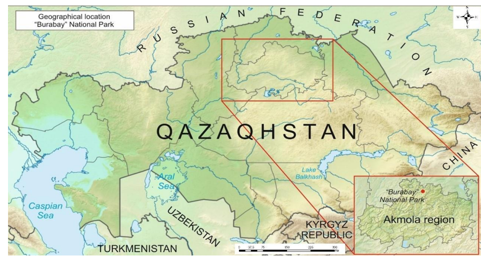
Figure 2. Geographical Location Burabay National Park

of the Republic of Kazakhstan and one of the most wellknown and most visited centers of tourism the country. Burabay, which is a wonder of nature, is called "Borovoye" in Russian. In fact, it is known that the name Burabay comes from Kazakh word "Bura", which means "camel". According to historical legends, a camel living in the vicinity Kokshetau, while grazing on the slopes of the mountain, sensing the approach of the enemy armies, climbed to the top of the mountain and warned