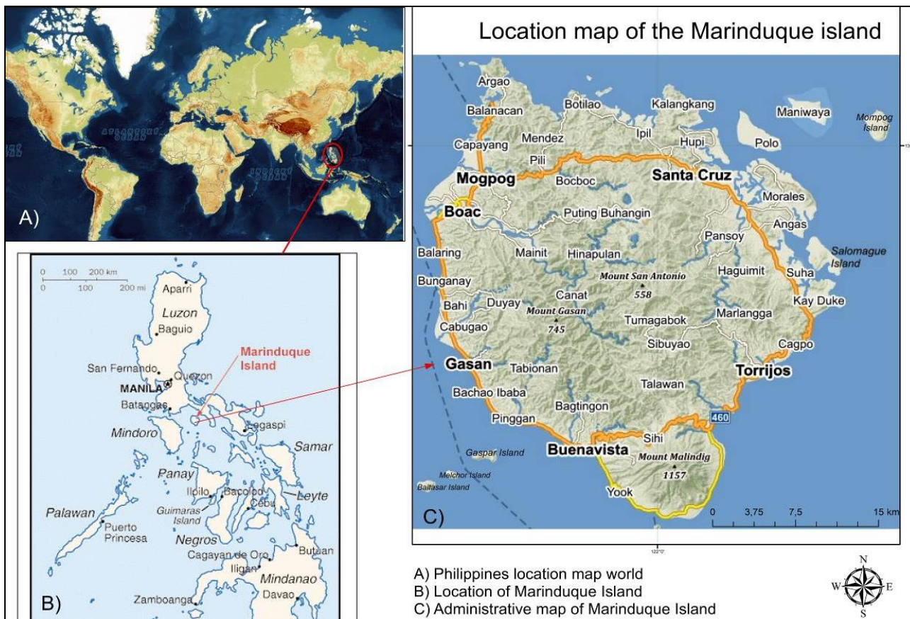
Figure 1. Location Map of the Marinduque Island

purpose of this study focused on the tourism geography was to introduce the geographical features, touristic attractiveness, tourism potential, tourism advantages and disadvantages of Marinduque, one of the most important, but not very well-known islands of the Philippines (Andriesse, 2018). The island of Marinduque, located in the central part of the Philippines and in the Sibuyan Sea, is bordered by Luzon to the north and east, Mindoro to the west, Burias and Masbate to the southeast, and Banton, Simara, Tablas, Romblon and Sibuyan to the south. The Tayabas bay located between the islands of Luzon and Mindoro, to the north of Marinduque and the Mompog strait located to the northeast separates this island from Luzon. Nevertheless, the Tablas strait separates the islands of Marinduque and Mindoro. Catanauan, General Luna, Pitogo and Lucena, located on the island of Luzon, are the port cities closest to the island of Marinduque. The capital of the province is the town of Boac. Santa Cruz, Torrijos, Gasan, Buenavista and Mogpog are the other major settlements of the Island**. The district centers of the island are also the largest settlements of the island.