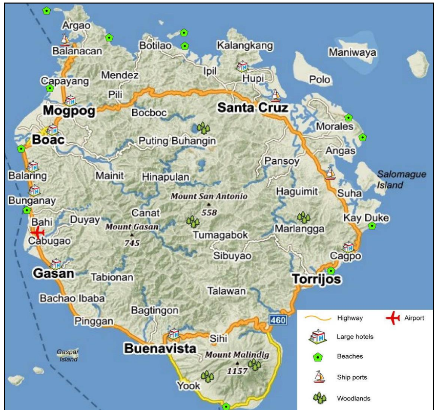
Figure 2. Tourism Map of the Marinduque Island (Compiled by the Author in the ArcGIS program)

This scientific study, which is part of the research program titled “The Republic of the Philippines from the Perspective of Political, Economic and Human Geography and Turkey-Philippines Interaction”, which was accepted by the Scientific and Technological Research Council of Turkey in 2020 within the scope of “2219-Overseas Postdoctoral Research Scholarship Program” and conducted by Emin Atasoy is one of its scientific outputs of this program. In the present study, the demographic, economic, geographical, economic and ecological characteristics of the Marinduque island was examined, and both the tourism advantages and disadvantages as well as the tourism resources of the island were attempted to be identified. The author conducted city surveys and geographical observations on the Marinduque island between 23 - 28 October 2022; as a result, he personally examined majority of the tourism centers on the island. The methodological basis of the study is the methods of a systematic scientific approach (Figure 3), comparative