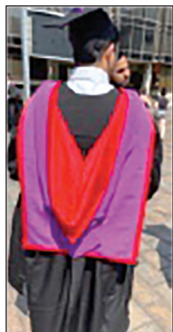
Fig. 16 (far right). Master of Research (MRes) hood.