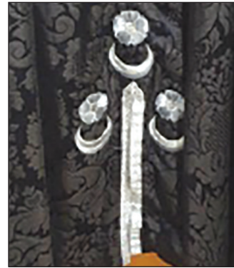
Fig. 43. Deputy Vice-Chancellor's robe (detail at back).