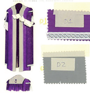
Fig. 13. Honorary Fellow (original grey).

previously it was the Advanced Certificate in Higher Education where it is now defined as the University Diploma. Finally, robe number 31 has also been changed in title being now the Diploma in Higher Education as opposed to the Advanced Diploma in Higher Education [see Fig. 11].