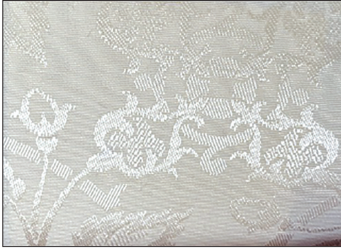
Fig. 9. Doctor of Music (DMus) St Aidan brocade.