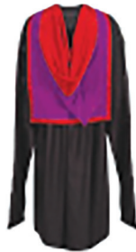
Fig. 28. Master of Surgery (MSurg).