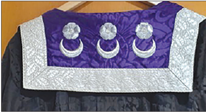
Fig. 41. Flap collar, Deputy Vice-Chancellor's robe.