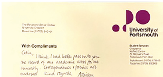
Fig. 1. Note from the Chaplain to the Vice-Chancellor

vation of the original papers. This, sadly, is not a practice that has been followed at every university in the UK, resulting in much lost information and frustration for those with an interest in chronicling the history of academical and official dress (see Fig. 1).