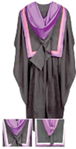
Fig. 21. Postgraduate Certificate in Education (PGCE) with Postgraduate Certificate (PGCert) and Postgraduate Diploma (PGDip) inset.