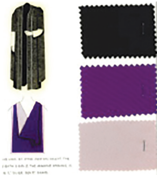
Fig. 5. MPhil dress.