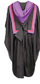
Fig. 20. Bachelor of Science (BSc).