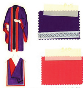
Fig. 7. DSc dress.

are like the hoods for bachelors, with 1" ribbons around the outside of the cape, of grey, mid-cherry and silver St Benet braid respectively, set next to the purple bindings although, except in the case of the PGCE, these are not really faculty colours. (See Fig. 8 for a chart of faculty colour ribbons that accompanied the original proposals for the scheme.)