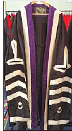
Fig. 42. Deputy Vice-Chancellor's robe (front).