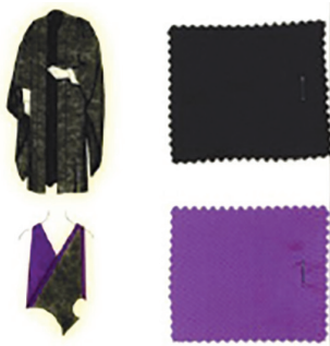
Figure 11. Diploma in Higher Education (DipHE).