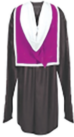
Fig. 24. Master of Arts (MA).