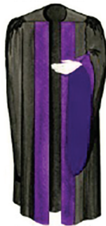
Fig. 45. Chairman of Governors' gown.