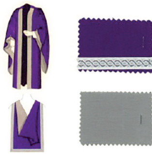
Fig. 12. Doctor of the University (original grey).