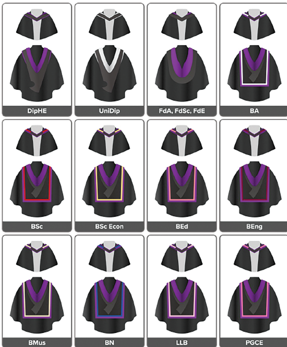
Table 1. Hoods of the University of Portsmouth, 1 of 3.