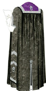
Fig. 44. Pro-Vice-Chancellor's robe.