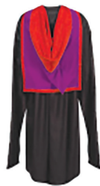
Fig. 25. Master of Science (MSc).