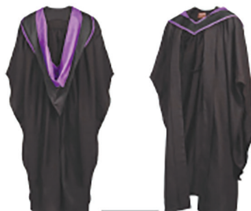
Fig. 17. Diploma of Higher Education (DipHE).

Hood: Scarlet polyester worsted [f1] lined and bound around the cape 1" with deep red taffeta and with 1" silver Benet braid around the outside the cape.