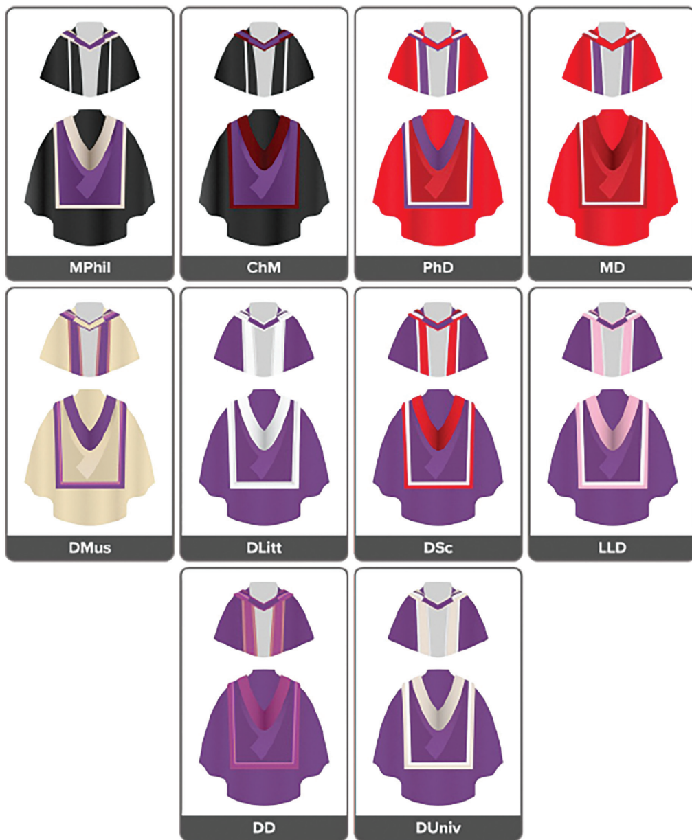
Table 3. Hoods of the University of Portsmouth, 3 of 3.