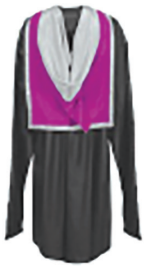
Fig. 27. Master of Philosophy (MPhil).