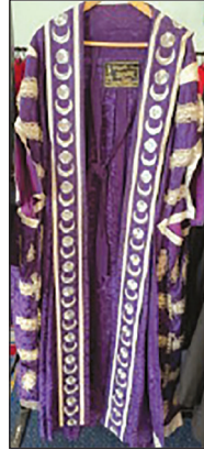
Fig. 37. Vice-Chancellor's robe (front).