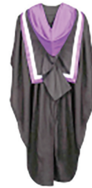
Fig. 19. Bachelor of Arts (BA).