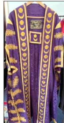
Fig. 35. Chancellor's robe (front).

with purple taffeta on the gown facings and at the yoke, the facings and edgings being trimmed with silver oak-leaf lace. The yoke shall be embroidered with three roses and crescents in silver thread. The sleeves shall be ornamented with three chevrons in silver oak-leaf lace and at the bottom of each sleeve there shall be a rose and crescent in silver thread. The bottom of the sleeve is to be edged in silver oak-leaf lace. (See Figs. 39–43.)