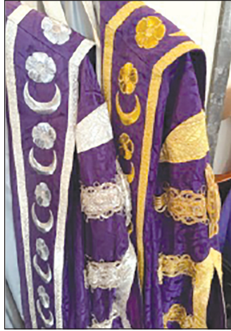
Fig. 31 (far left). Vice-Chancellor and Chancellor. Fig. 32 (near left). Vice-Chancellor and Chancellor's robes.