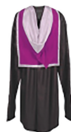
Fig. 26. Master of Architecture (MArch).