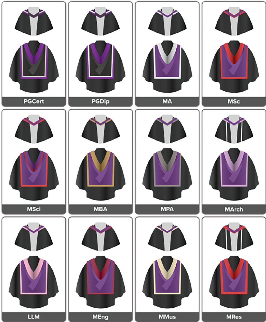
Table 2. Hoods of the University of Portsmouth, 2 of 3.