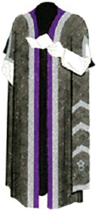
Fig. 39. Deputy Vice-Chancellor's robe (front).