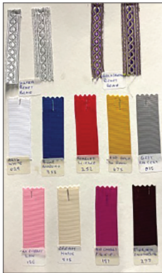
Fig. 8. Faculty and Certificate colours.

I remember we borrowed the cherry and pink colours from Cambridge academic dress and the lavender is in fact Palatinate purple from Durham. 28