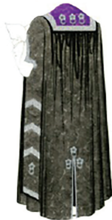
Fig. 40. Deputy Vice-Chancellor's robe (back).