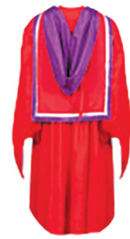
Fig. 29. Doctor of Philosophy (PhD) and Prof. Doctorates.