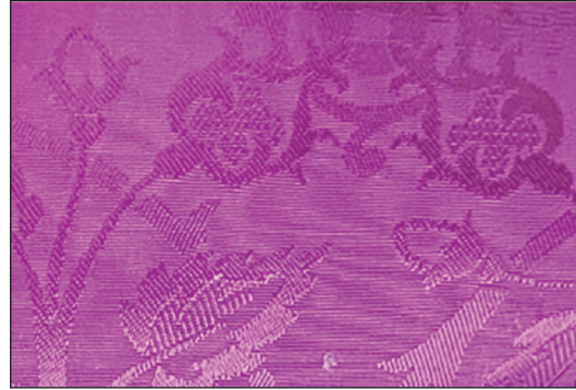
Fig. 10. Doctor of Divinity (DD) St Aidan brocade.