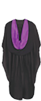
Fig. 18. Foundation Degrees (FdA, FdSc, FdE).