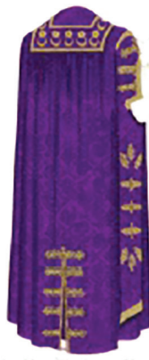
Fig. 34. Chancellor's robe (back).