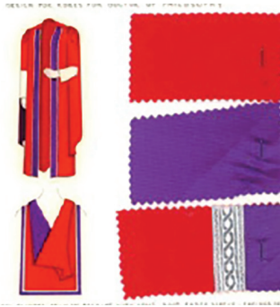
Fig. 6. PhD dress.