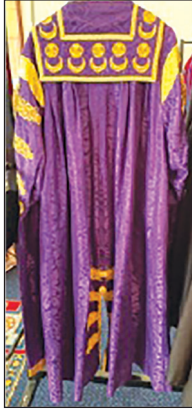
Fig. 36. Chancellor's robe (back).