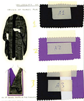
Fig. 2. BA dress.