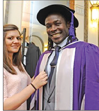
Fig. 14. Doctor of the University (DUniv) robes with dove grey taffeta.

and the dress for Honorary Fellows and Associates as well as for the Master of Philosophy (MPhil) hood.