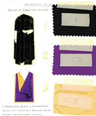
Fig. 4. MBA dress.

Advanced Diploma in Higher Education (DipHE) were added soon after.