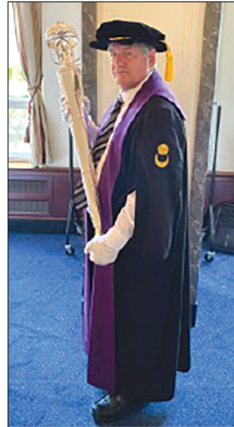
Figs 46, 47. Mace Bearer's gown.

rather makes the DUniv hood look like the logical PhD hood (it being the MPhil hood with the addition of the silver braid around the cape). 57