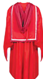
Fig. 30. Doctor of Medicine (MD).