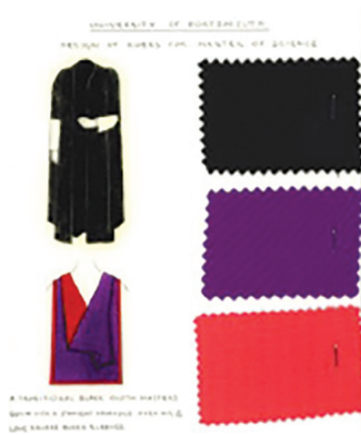
Fig. 3. MSc dress.