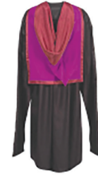
Fig. 23. Master of Engineering (MEng).