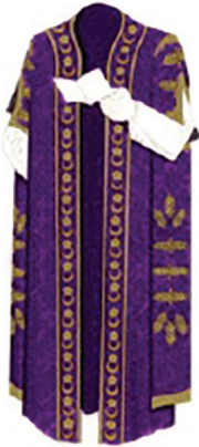
Fig. 33. Chancellor's robe (front).