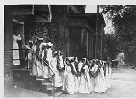
Fig. 4. 'Judson photograph of graduates of Judson College in Marion, Alabama, c. 1900'.