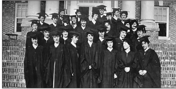
Fig. 8. University of Delaware's first female class in 1918.