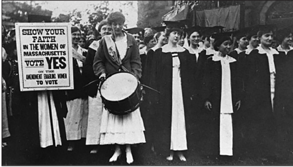
Fig. 7. Mount Holyoke College, 1916.