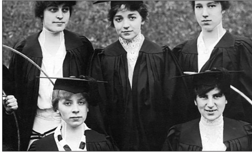
Fig. 6. '1915. May Day', Wellesley College.