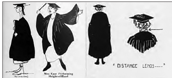
Fig. 9. 'Collar Caricatures', a cartoon at Wellesley College.